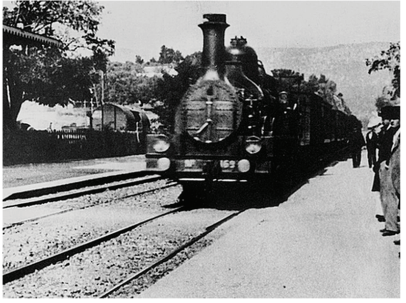
Figure 5: Louis & Auguste Lumière: The Arrival of a Train at La Ciotat Station (film still); 50 sec.; ca 1897

Similarly to the spatio-temporal ambiguity triggered by the Kaiserpanorama's gaslight in Benjamin's text, we find that the lighting system of the panorama blends different levels of reality in an equally complex manner. As noted, panoramas use natural light to illuminate their painted canvases. The threshold where the light enters the rotunda is hidden from the audience. Since panorama pictures often present distinct meteorological conditions and phenomena, their producers sought to achieve a preferably neutral impact from the outside world.