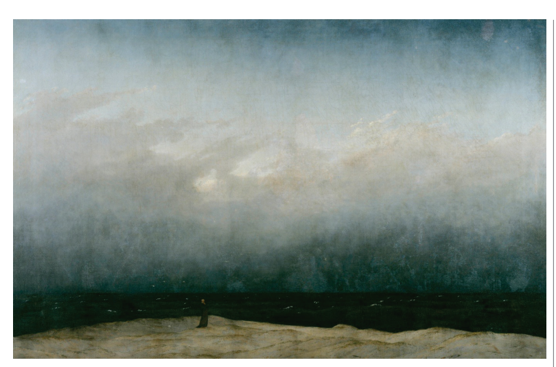
Figure 1: Caspar David Friedrich: Monk by the Sea ;1808-10; Alte Nationalgalerie, Berlin; 110 \times 171.5 cm; oil on canvas; © b p k - Photo Agency / Nationalgalerie, Staatliche Museen zu Berlin / Jörg P. Anders.

tion of the "voice of life in the roar of the surf, the rush of the wind, the drift of the clouds, the lonely crying of birds". This mixed emotion is further described as a rupture between "an appeal from the heart and a rejection [...] from nature", however, the sublime experience of the boundless ocean is impossible "in front of the picture". This is where the mediality of the painting is brought into focus. Brentano replaces the ambivalent experience of nature with the ambivalent and mediated experience of the picture. A shifting of perspectives takes place: "and that which I should have found within the picture I found instead between the picture and myself". How this discovery is to be imagined is explained immediately after: "and so I myself became the Capuchin monk, the picture became the dune, but that across which I should have