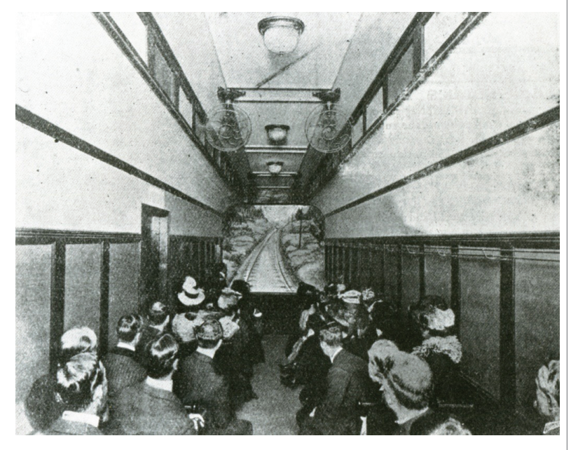
Figure 6: George C. Hale: Hale's Tours and Scenes of the World (interior view); The Kinematograph and Lantern Weekly, 1 October 1908.

As the film's main 'protagonist', the train also represents one of the iconic ciphers of modernity. More than any other mode of transportation, it embodies modernity's acceleration of time and space, as noted by so many in its early decades (Rosa & Scheuerman, 2009). The same acceleration of time and space is at work within the medium of cinematography. The film camera not only captures objects and bodies in motion, but the camera is itself a moving body, a body that penetrates, explores, accelerates, cuts through and scales up and down space. 16 With this, cinematography - especially as it is cinematically performed - becomes a privileged medium for visualising the accelerated perception and dynamics of modernity. In accordance with the modern experience of train travel, the virtual travel medium of cinematography does not primarily teleport the spectator to another place. Instead, it embodies, presents and reflects the movements of