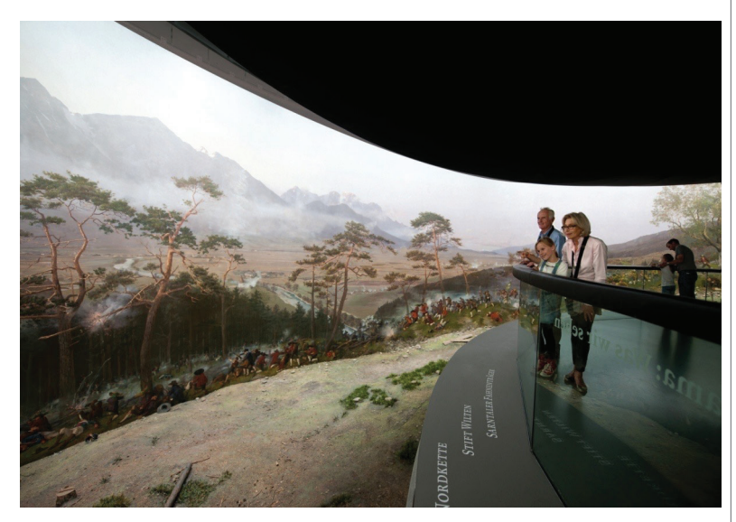
Figure 4: Michael Zeno Diemer: Panorama of the Battle at the Isel Mountain in 1809 (partial view); Tirol Panorama, Kaiserjägermuseum, Innsbruck, Austria; © Alexander Haiden.

...there is a certain appeal to panoramas. It is rooted in the mixture of stillness and indicated movement, of illusionistic vastness and actual narrowness. The silent noise of battle panoramas in particular has something