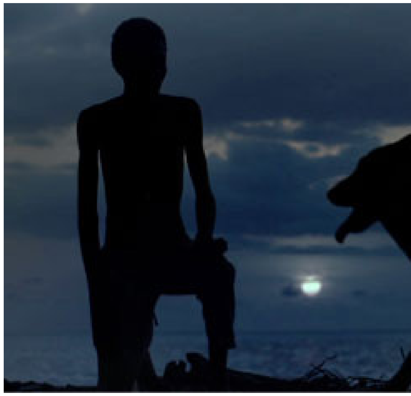
Picture 16 - American night. At the beachfront the clouds were worked by Pedro Louro in special effects as in the inclusion of a dog in the image. The dog was recorded on studio in Chroma Key and Nuno Garcia's colour correction enhanced the clouds and achieved a silhouette. The image was made in broad daylight. In the background it isn't the moon it is the sun.