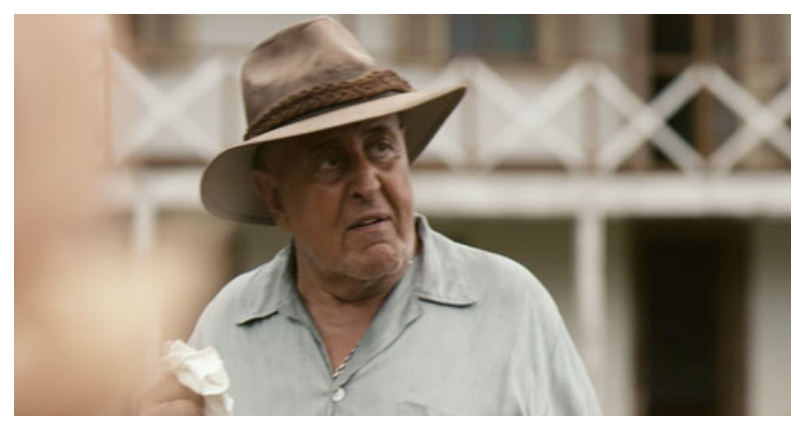
Picture 5- Example of a shot without depth of field. The character stands out from the background and gives depth as three- dimensionality to the image.