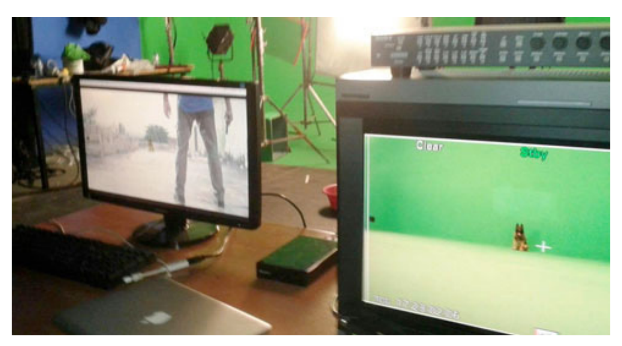
Picture 30 – a picture of the work being developed at the studio recording the dogs in Chroma Key to then introduce in the images collected in Africa.