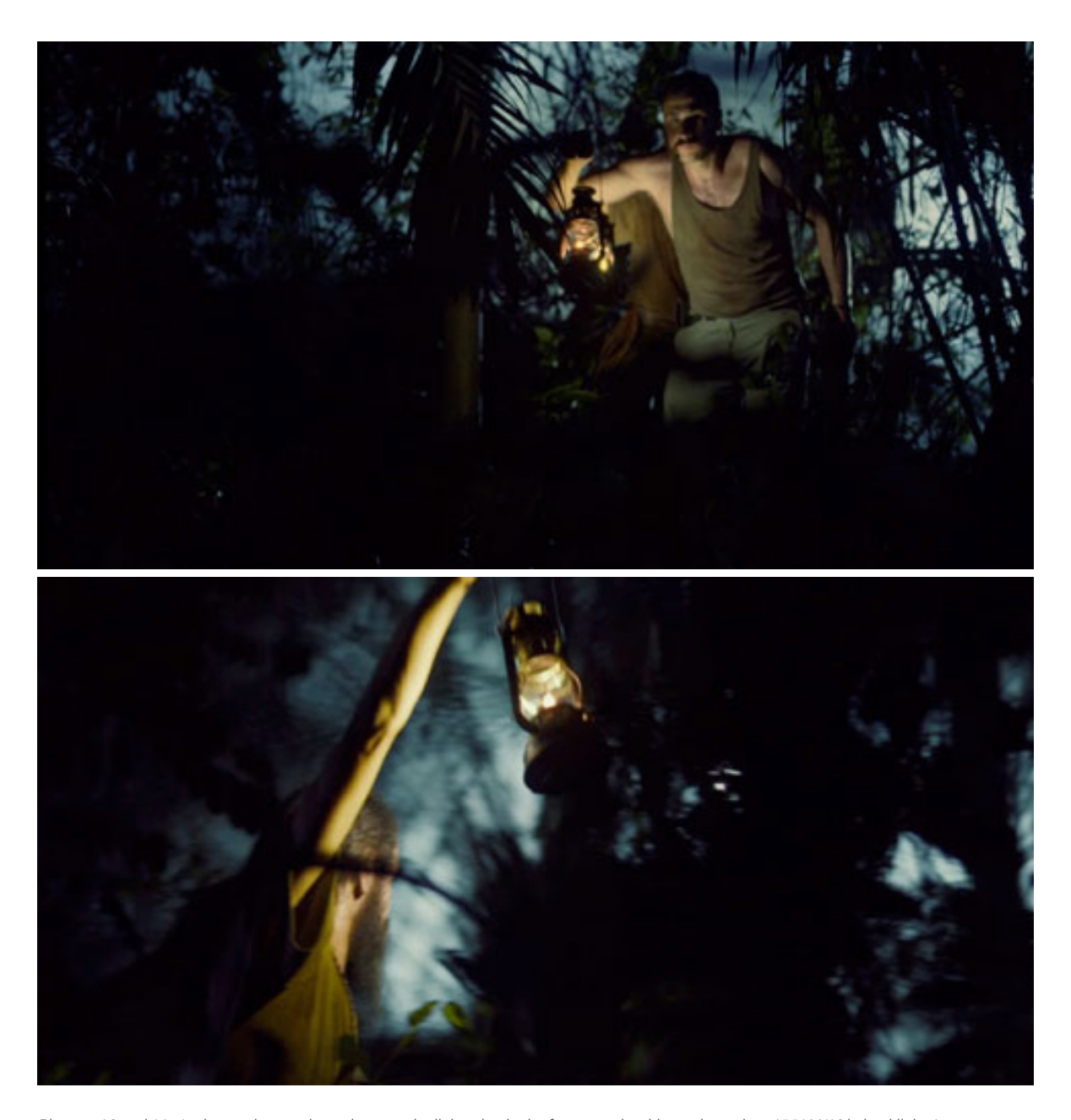
Pictures 10 and 11 - In the two images it can be seen the lightening in the forest made with smoke and an ARRI M/18 in backlight. Lanterns were equipped by Pedro Paiva, the chief electrician, with a LED powered with a battery and covered with a CTO filter to enlighten the face.