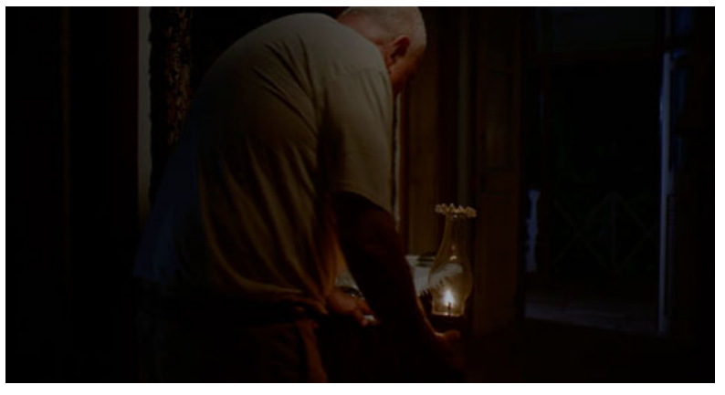
Picture 3 was taken from the raw recording and Picture 4 after colour correction. It was decided to leave only the lamp light, which is actually the Fresnel's light which is creating the lamp effect. The light perche was oriented by Pedro Paiva, the Lighting Chief.