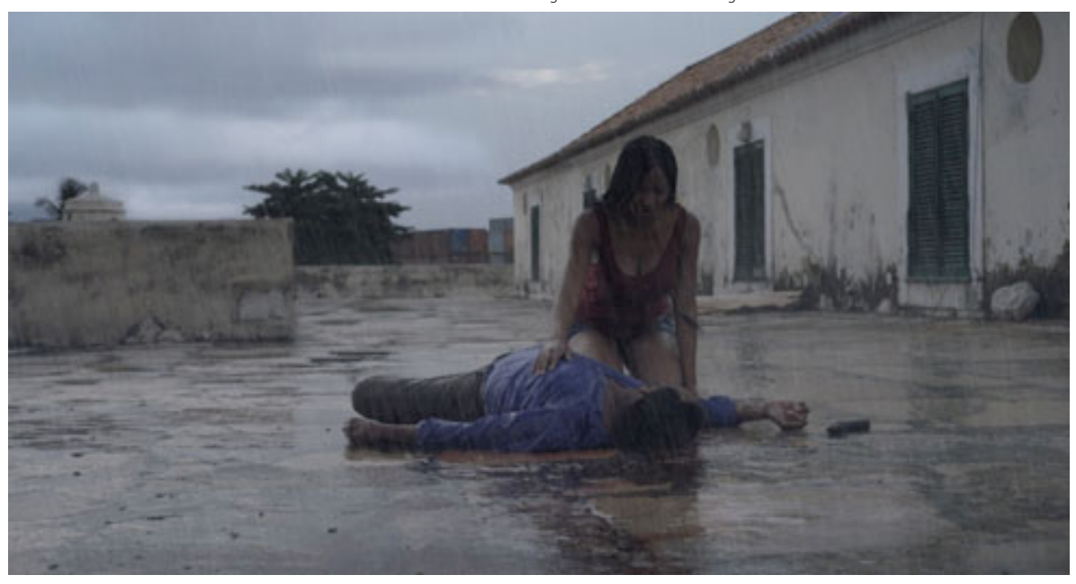
Picture 29 – The final scene of the film is dramatized with rain and stormy clouds and enhanced with artificial rain.