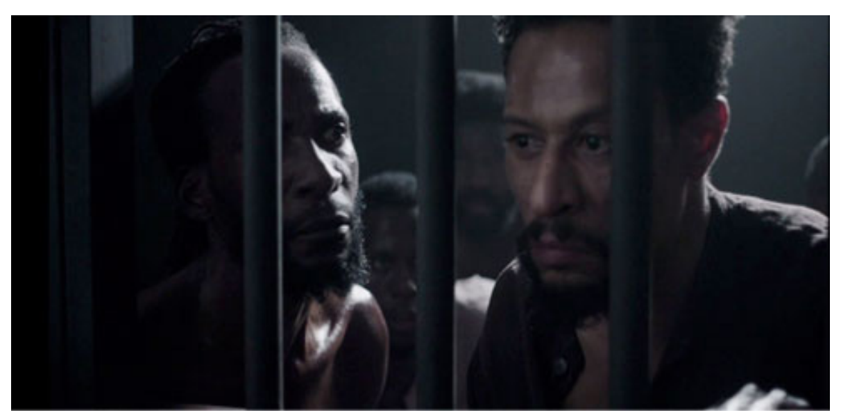
Picture 19- The heavy and intense environment in the cell, created by the light direction and the space darkness.