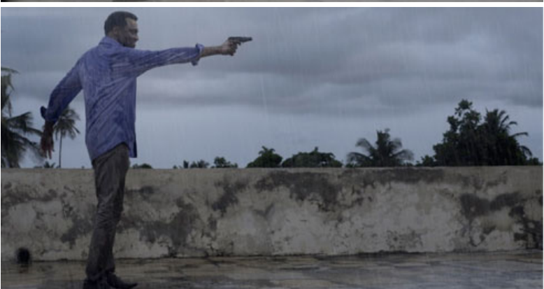
Picture 27- Special effects: in picture 26 the raw image, where a post and electrical cables on the site can be seen and the final image in picture 27. The scene is filmed with rain coming from a hose belonging to São Tomé's fire fighters and in postproduction more artificial rain was added, as well as the clouds were reinforced to dramatize the film's last scene. Special effects by Pedro Louro and Filipe Luz.

environments, without the pressure of schedules and without the pressure of equipment management, climate change and position of the sun, is a great example of what was one of the main conclusions of our reflection on the teaching of cinematography: that more than the change of technology, it is the essential change of the role and position of the cinematographer in the value chain of production which is the great transformation of our day. This is an extraordinarily important factor in the creation of the modern image, where allied digital capability allows us the freedom to create the image almost entirely from an initial gathering.