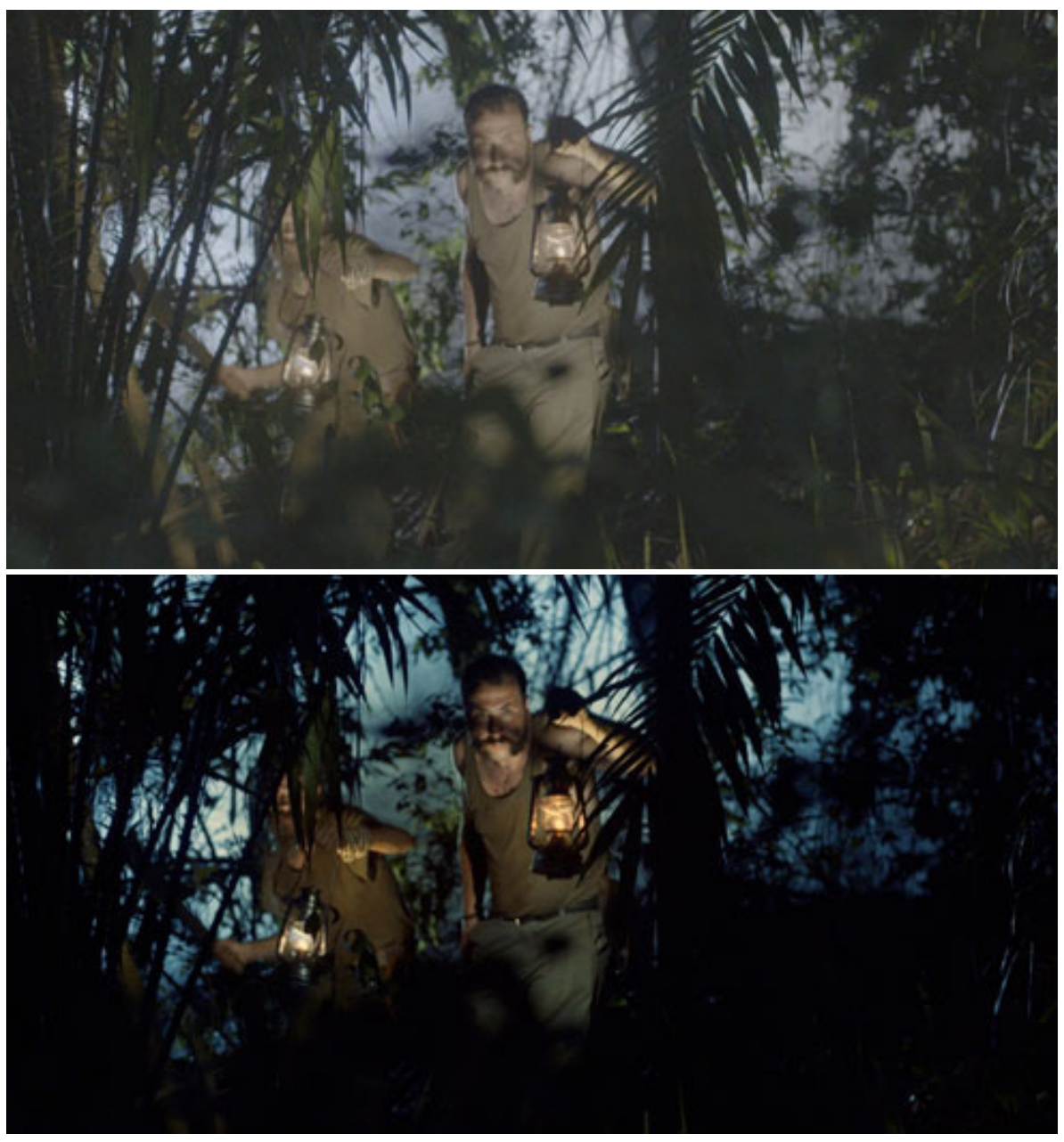
Pictures 12, 13, 14 and 15 - Images of the Forest previous and after the colour correction. It was fundamental to control the o waveform at the capture moment. The blacks were too low and here the S-log 3 was fundamental for the exposure, allowing to obtain a larger latitude in the colour and a best signal in the black areas. It's in this particular one that SONY F55 is excellent.