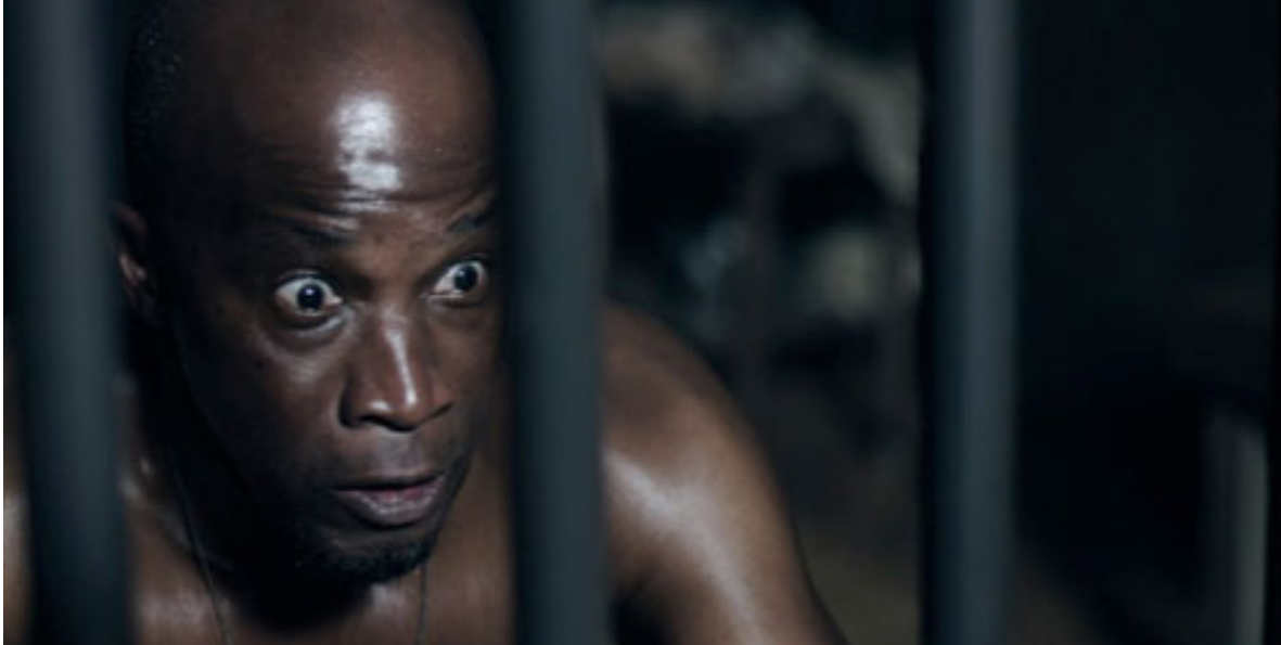
Picture 22 – Image of the prison, filmed in the studio. The RAW image (picture 21) captured with a 4K resolution and the 16 bits samples coding and after the colour correction (Picture 20). Here at this scene, supposedly at night, has a colder tone in the narrative than other moment in the cell. The main light, coming from the window in a frontal and tall way, projects the shadows to the ground and leaves the backgrounds black.