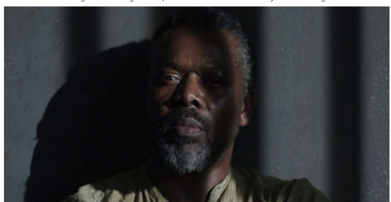
Picture 6- Framed to the centre. Giving relevance and importance to his narrative and the story he is telling us.