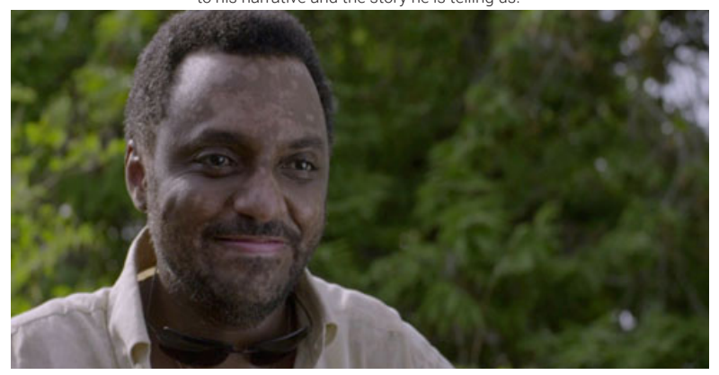
Picture 7– Frame respecting the thirds rule with the camera slightly lower than the height of the eyes, giving him importance and power at the moment he is ordering his men.

situations one needs to operate with the camera at the shoulder, offering a view-finder with clear sharpness and with the framing marks of our choice, waveform and display where all the necessary information is, without disturbing the field of vision of the camera operator.