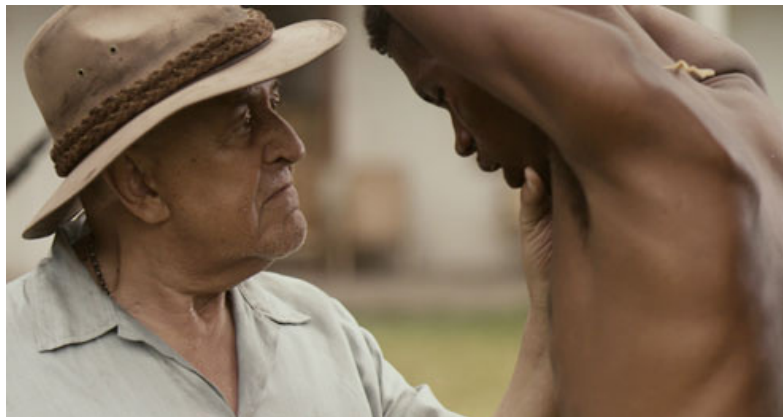
Picture 1-Nicolau Breyner plays the farmer role, the scene in the film which marks the 1950s. In picture 1, the original image and in Picture 2 is warmer and more orange to transmit the ageing feeling.