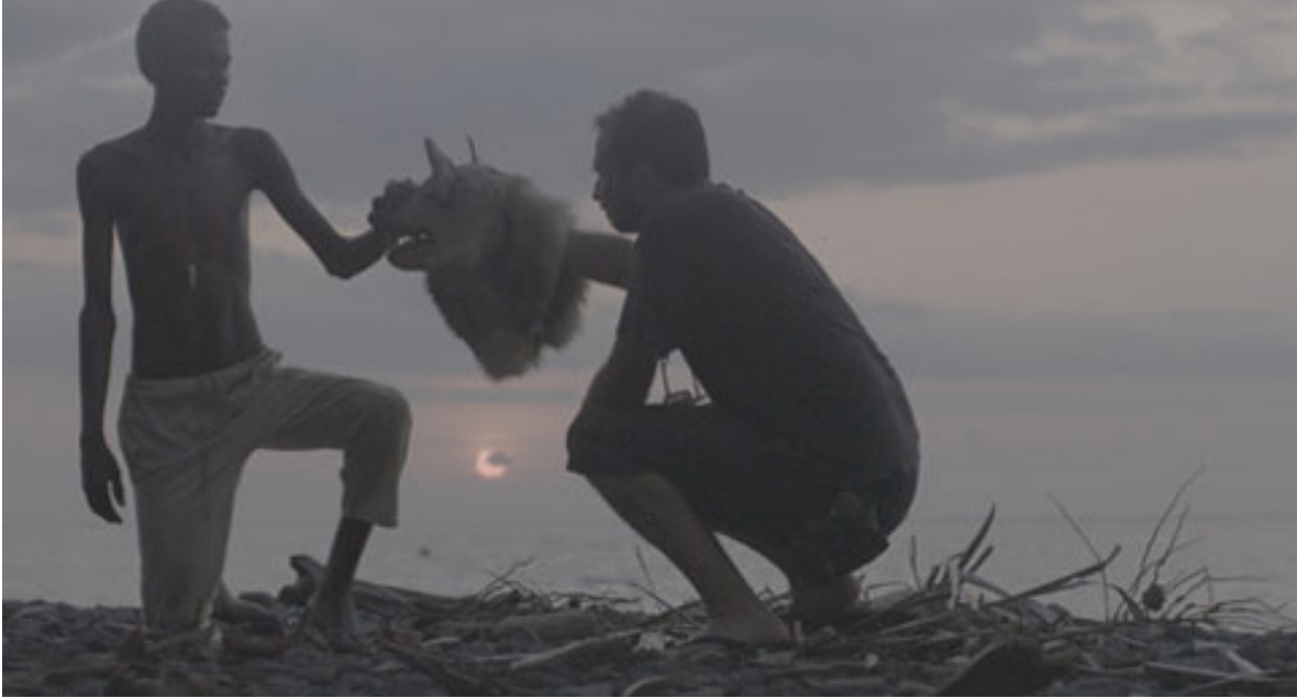
Picture 17 and Picture 18 - The raw images obtained in broad daylight, prior to special effects and colour correction that transformed them into night time. Bruno Caldeira places the dog's head to adjust the framing. Afterwards, the digital special effects replace it with the dog recorded on studio in Lisbon.