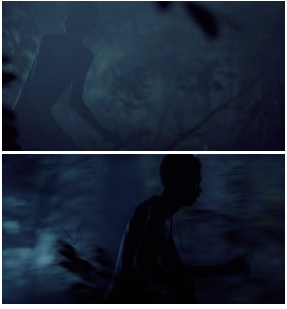
Picture 8 and picture 9- The night at the forest lightened with a ARRI-M18 against the smoke and a lateral 800W for cutting.