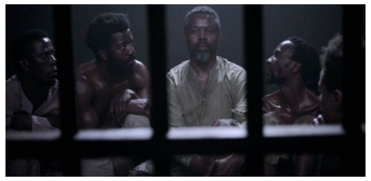
Picture 20 - The intensity of the cell environment where the central character stands out from the group of prisoners. The importance of the wardrobe designed by Silvia Grabowski in contrast with the remaining elements highlights the scene's main character.