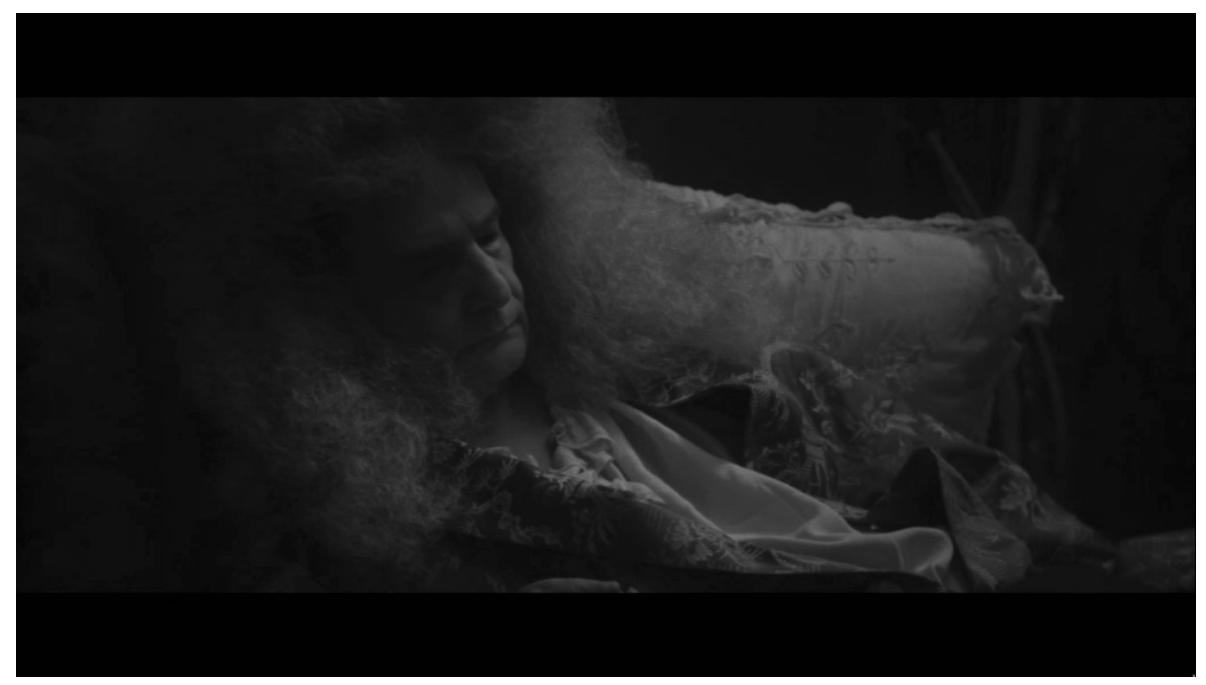
Figure 8. The King is a dying old man.

In another pivotal scene, the King admonishes his great-grandson who is the heir to the throne. He advises the child not to imitate him in his love for buildings and war. He urges him to make peace with his neighbors and give back