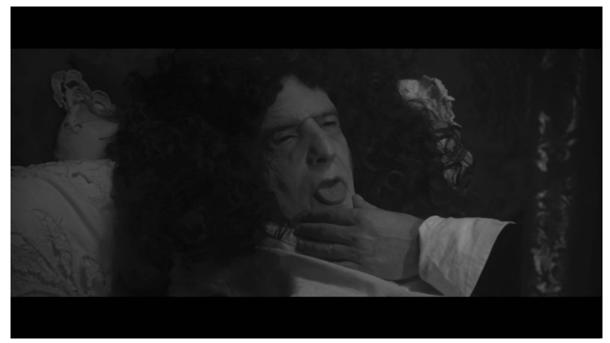
Figure 16. The King as object of survey

The most effective use of any-space--whatever happens in the moments which portray the King alone, bat-tling the faceless enemy that is death. Shrouded in almost complete darkness, the King is in bed, writhing from pain, calling out for water in a frail voice. The valet slowly advances towards the King, with a glass of water. The King slaps