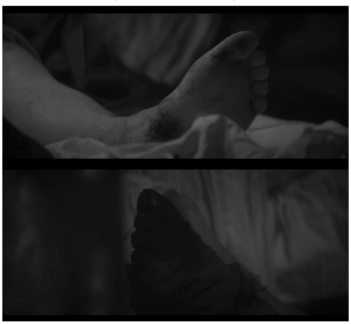
Figure 17 & 18. Fetishistic fragments of the King's body.

continue to be King. In the final scenes of the film, the King is barely lucid; he orders what shall become of his body parts after death. One could argue that this final attempt at controlling his own body is an attempt at containing the