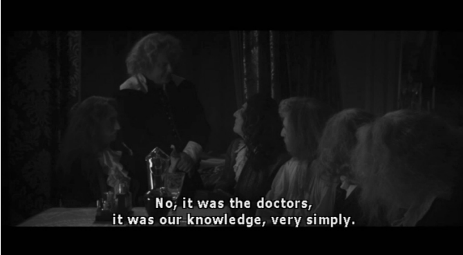
Figure 13. Caravaggio's 'Supper at Emmaus' and a still from 'The Death of Louis XIV'