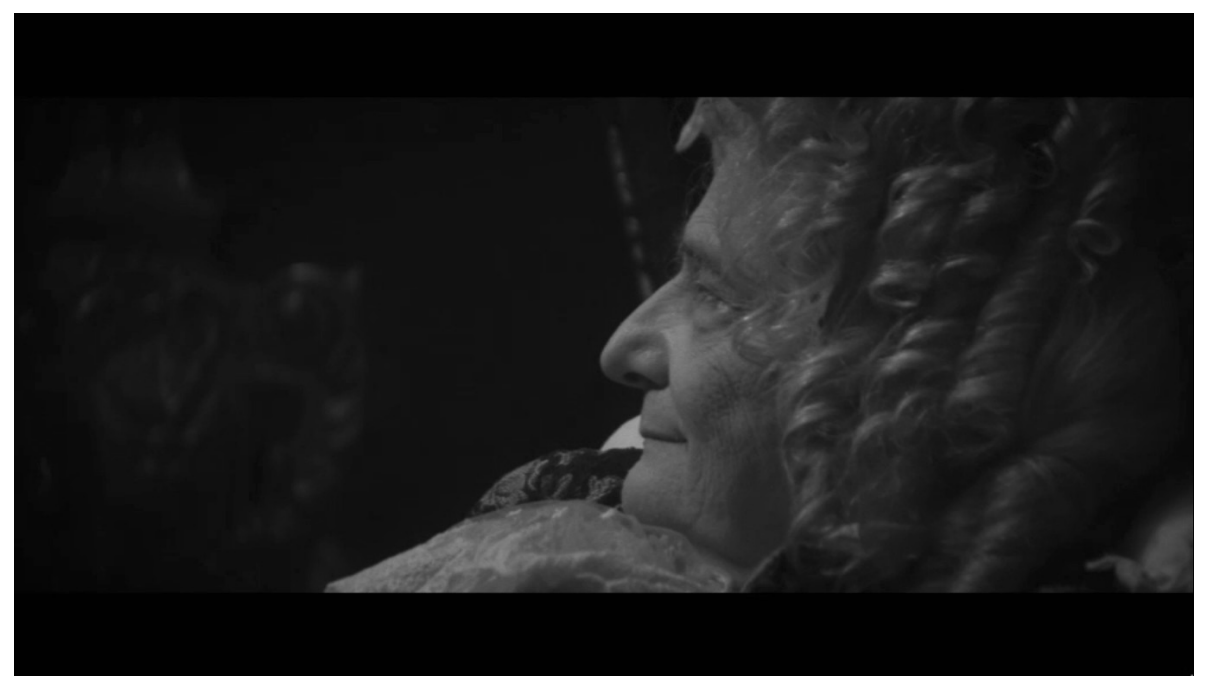
Figure 6. His favorite dogs are taken away.

lies in bed, solitary, placed horizontally in the frame, a visually inactive and passive figure. He is briefly animated by the arrival of the 'dogs that I love so much'. He kisses and embraces them fondly. An uncharacteristic pan, the only one in a film comprised of still frames, from the dogs to the King illustrates their bond. But the dogs are taken away as part of doctor's orders and the activity abruptly comes to an end. The King's face is impassive, but the muscles on his cheek twitch as he looks on silently. Because of his sickness, i.e. death, the King is unable to exercise his power to veto the doctors' orders. The action of the scene gives way to an 'affective'