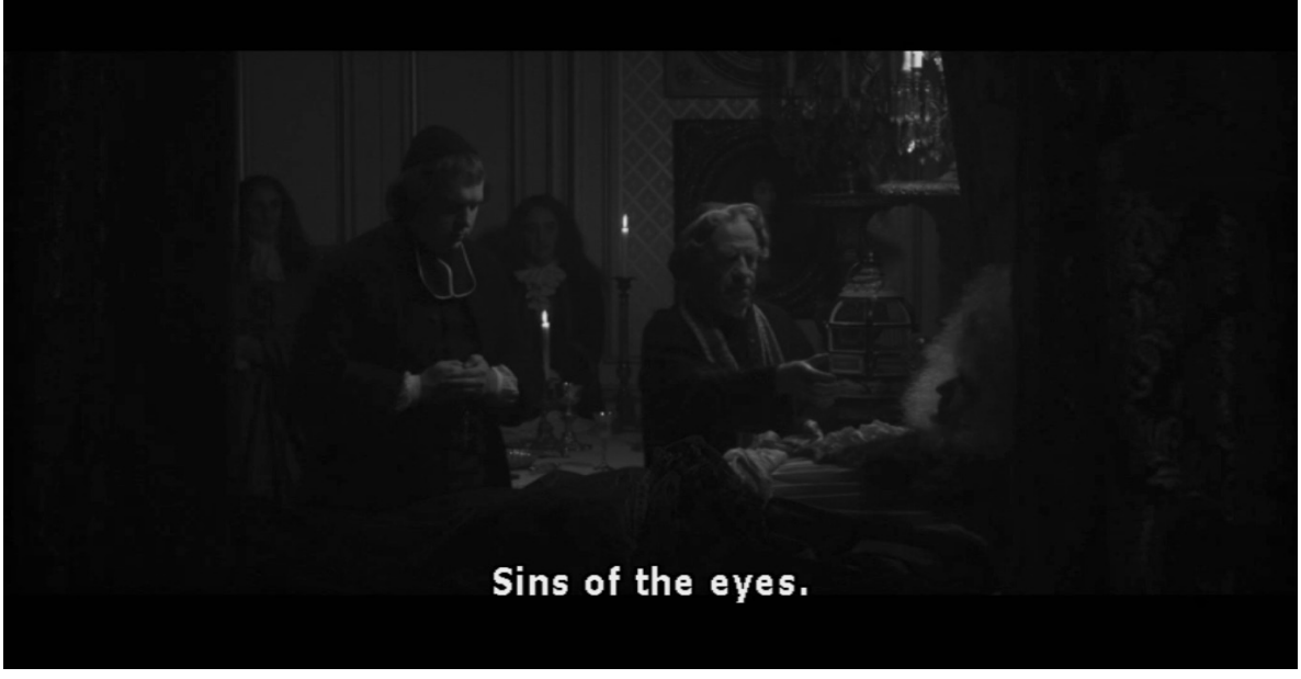
Figure 20. Meaningless rites.