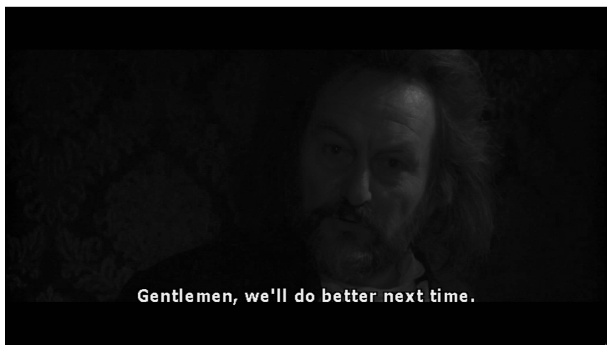
Figure 27. Final image of film

become a perversion because of their ineffectiveness and senselessness. The redundant 'treatments' that start with Doctor Fagon continue with the arrival of the Sorbonne doctors and, finally, with the charlatan Doctor Lebrun who succeeds in feeding the King 'bull's sperm and blood with frog fat'. These doctors who so effortlessly belittle each other as impotent, cannot themselves create effective solutions: at the end, their actions implode (impulse images implode while action-images explode). As the King's body decays, they realize that they must find a culprit lest they will be held accountable for the King's death. When the King is barely lucid and taking his last breaths, the court doctor