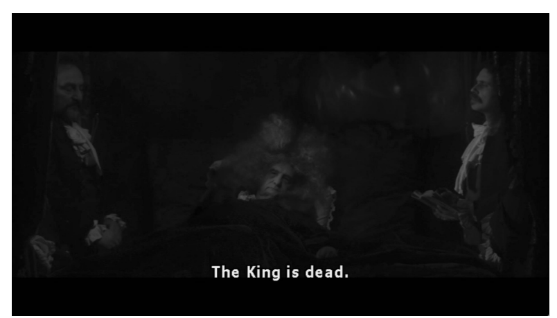
Figure 24. "...all the parts converge in an immense rubbish-dump or swamp, and all the impulses in a great death-impulse..."