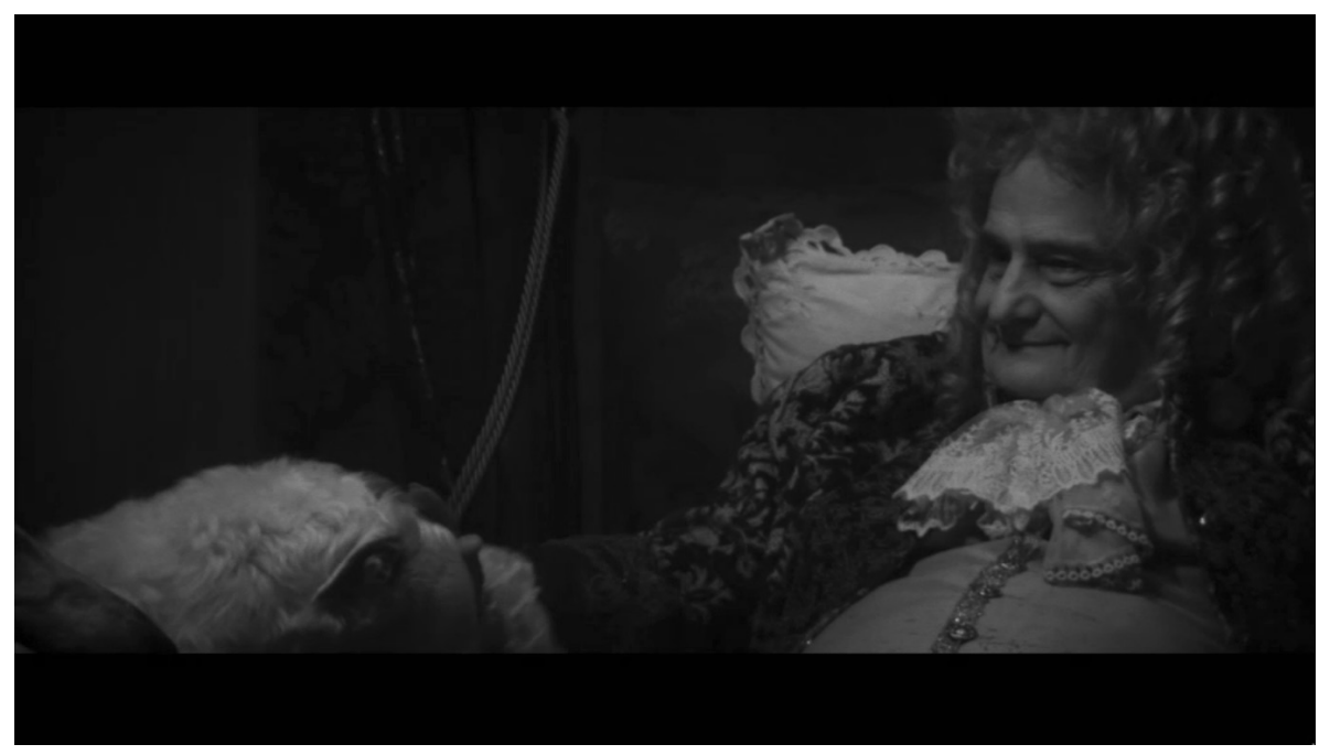
Figure 5. The King lovingly caresses his favorite dogs.

In the Death of Louis XIV , the potential energy in the affection-images are never released to become force and action.