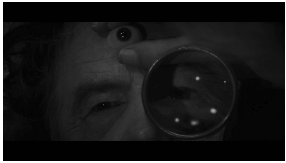
Figure 15. Fragmentation of the King's body

significance of the space is effaced to become the any-space-of-any-sick-person. The space lacks perspective and is two-dimensional. The claustrophobia is created by firstly, the camera that focuses on the immobile King, and secondly, by the shadows that cover all corners. "The shadow extends to infinity. In this way it determines the virtual conjunctions which do not coincide with the state of things or the position of characters which produce it..." (DELEUZE, 1997, 112) Whether it be a lively party with the court ladies or a business meeting concerning the building of a new bridge (during the day), the spaces are dark and brooding.