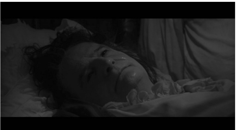
Figure 14. Caravaggio's 'David and Goliath' and a still from 'The Death of Louis XIV'