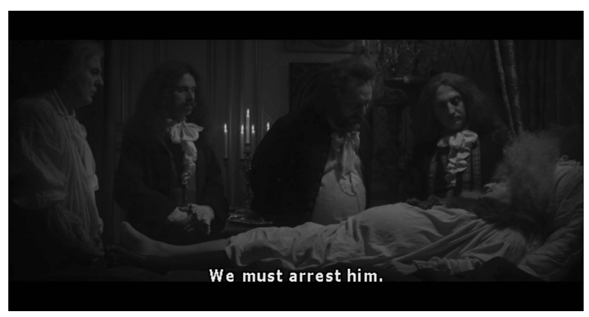
Figure 19. Doctor Fagon asks an unconscious King for the punishment of Doctor Lebrun.