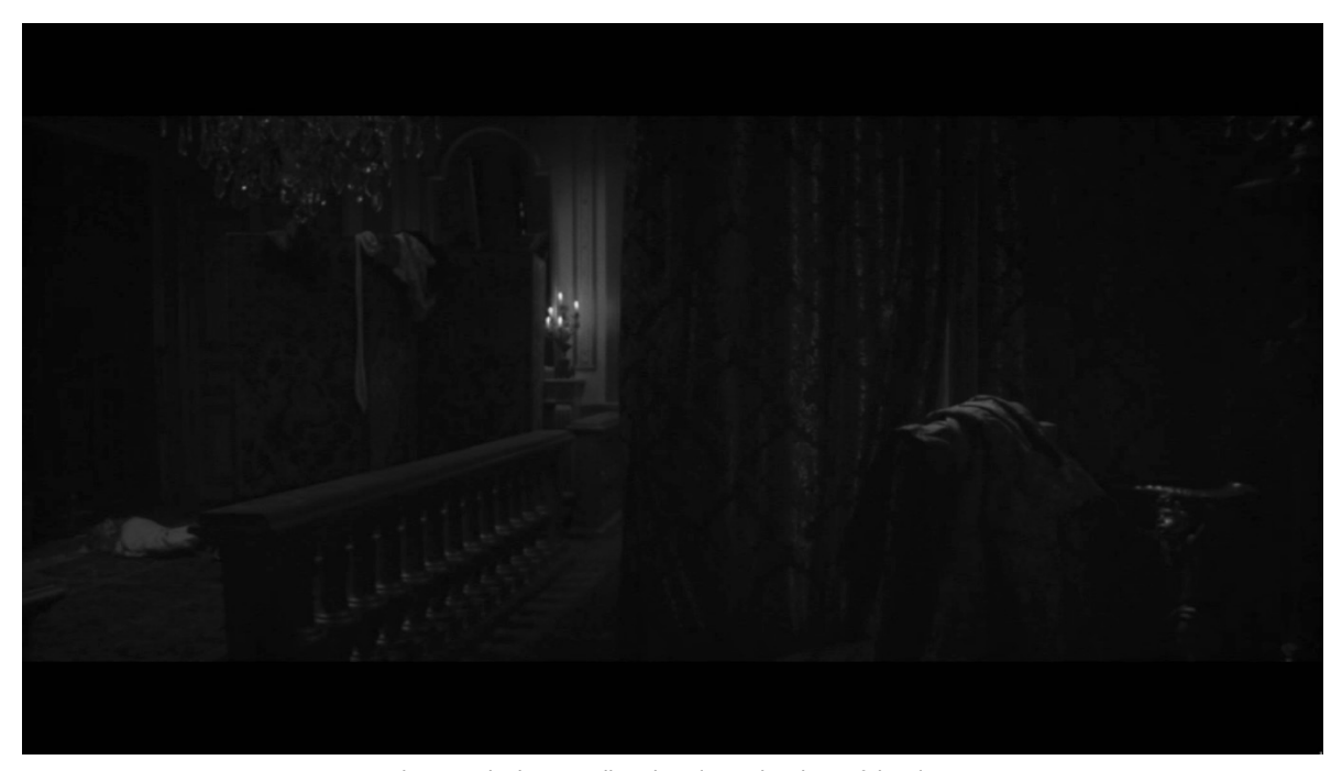
Figure 9. Shadows swallow the private chambers of the King.