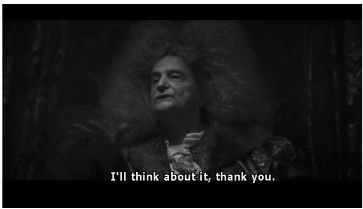
Figure 11. A business meeting in darkness...