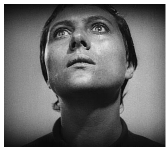
Figure 2. Image from Dreyer's The Passion of Joan of Arc (1928)

"Peirce does not conceal the fact that firstness is difficult to define, because it is felt, rather than conceived: it concerns what is new in experience, what is fresh, fleeting and nevertheless eternal... these are qualities or powers considered for themselves, without reference to anything else, independently of any question of their actualization. It is that which is as it is for itself and in itself. It is, for example, a 'red', as present in the proposition 'this is not red' as in 'this is red'... It is not a