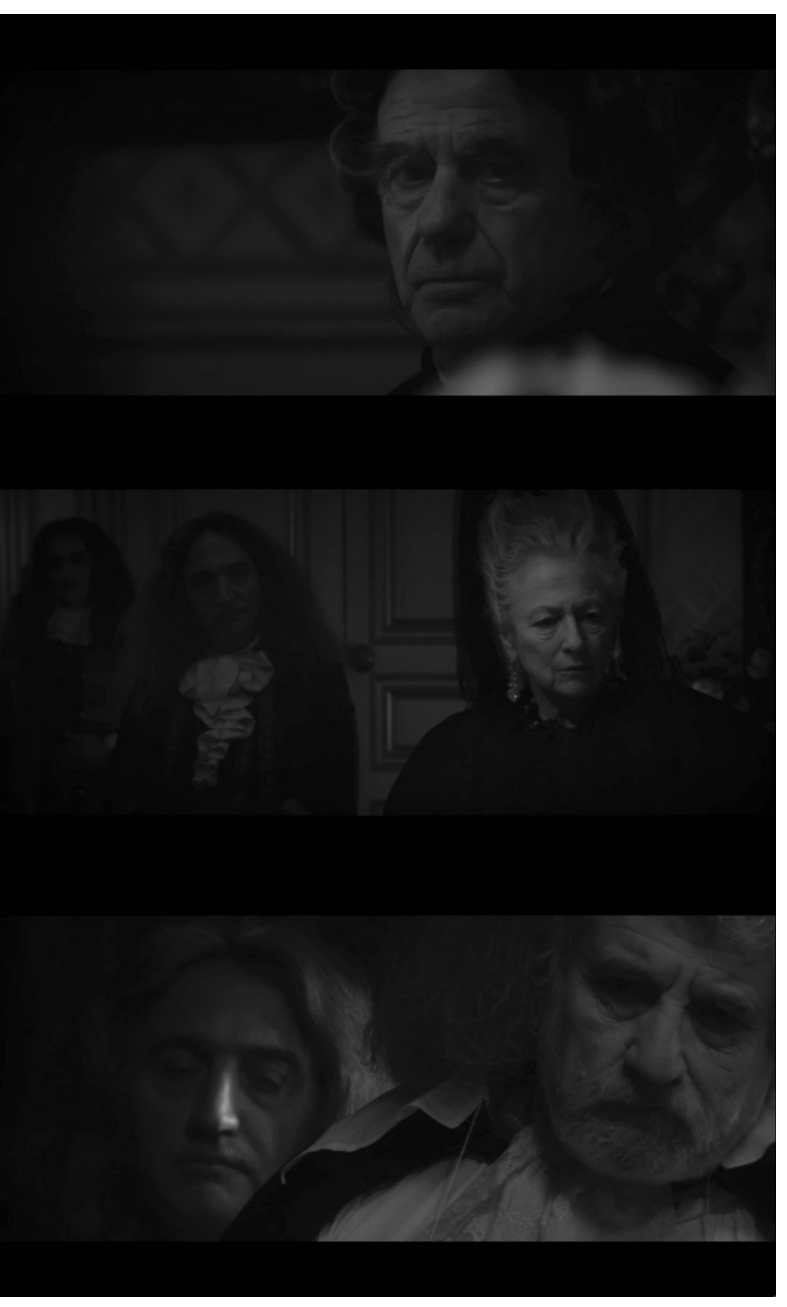
Figures 21, 22, 23. Violence of the gaze of others.

The above impulse-images are what Deleuze calls fetishistic fragments. Even though they are traditionally 'close-up shots', they are not affection-images. They do not impart a quality of power or