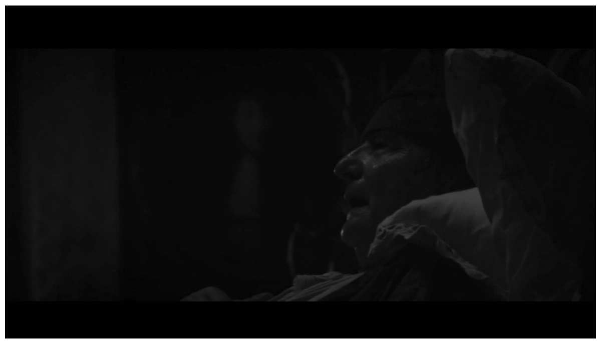
Figure 12. Any-space-whatever