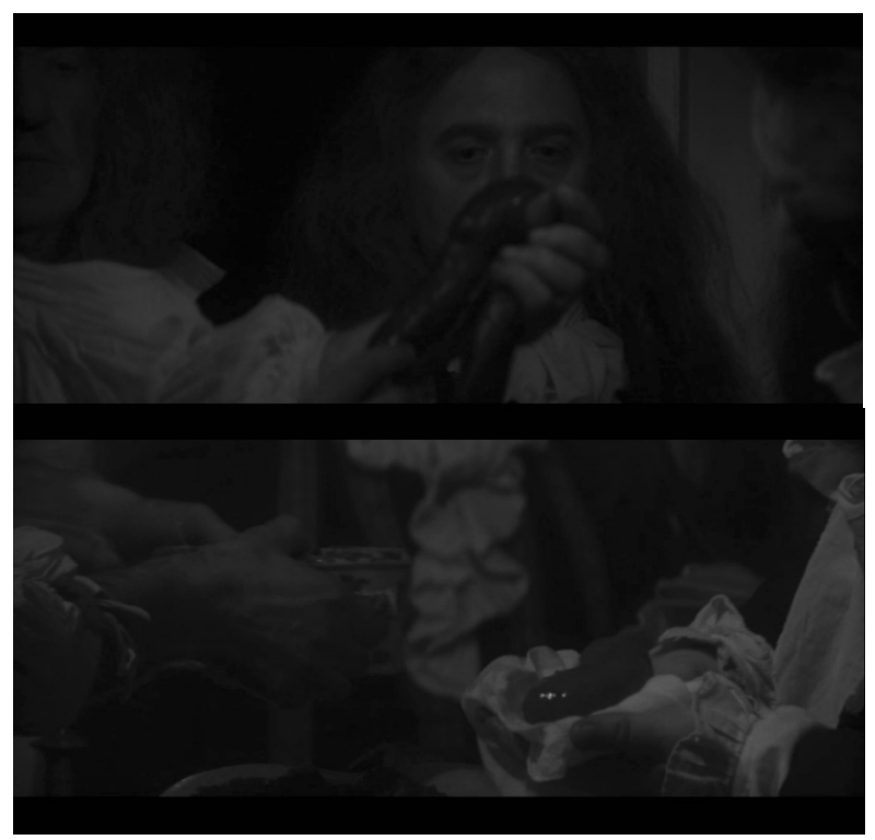
Figures 25 & 26. What's left of the King.

expression. They are pure impressions or symbols without any active or affective power. Deleuze adds that the impulse-image is "...undoubtedly the only case in which the close-up effectively becomes partial object... The impulse is an act which tears away, ruptures, dislocates" (1997, 128). The impulse-image is not a quality or power as expressed; it is the literal image of a broken and severed body or subject. It is magnification and dismemberment. It is a fragmented and fractured image.