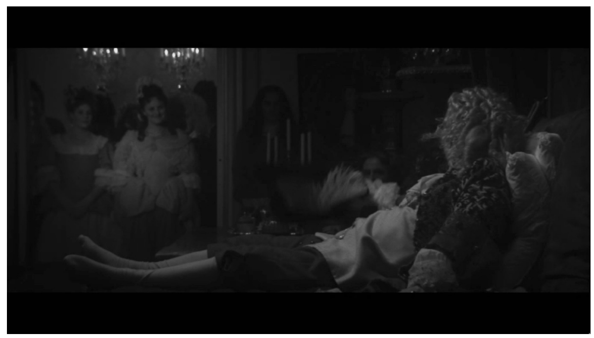
Figure 10. A royal party?