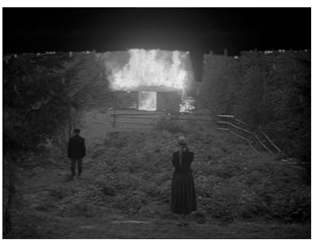
Figure 3. Image from Tarkovsky's The Mirror (1975)