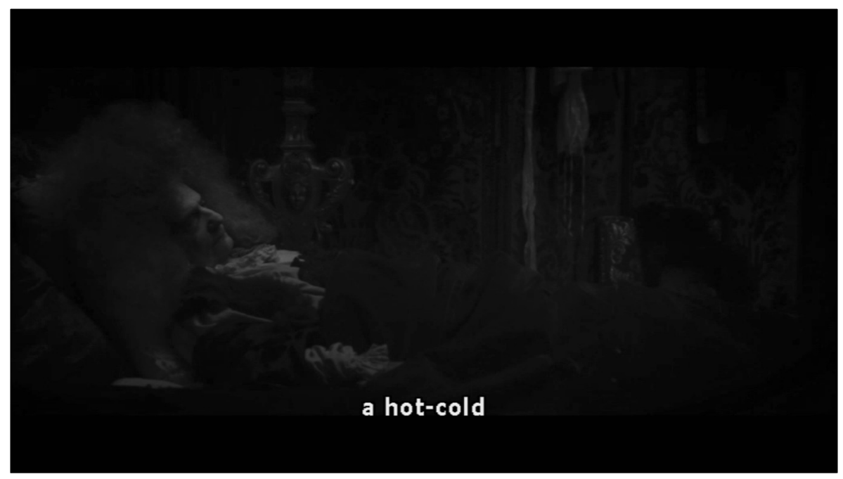
Figure 18. Ultimately, even the mind degrades.

As we can see, the impulse-image is no longer affection-image but is not