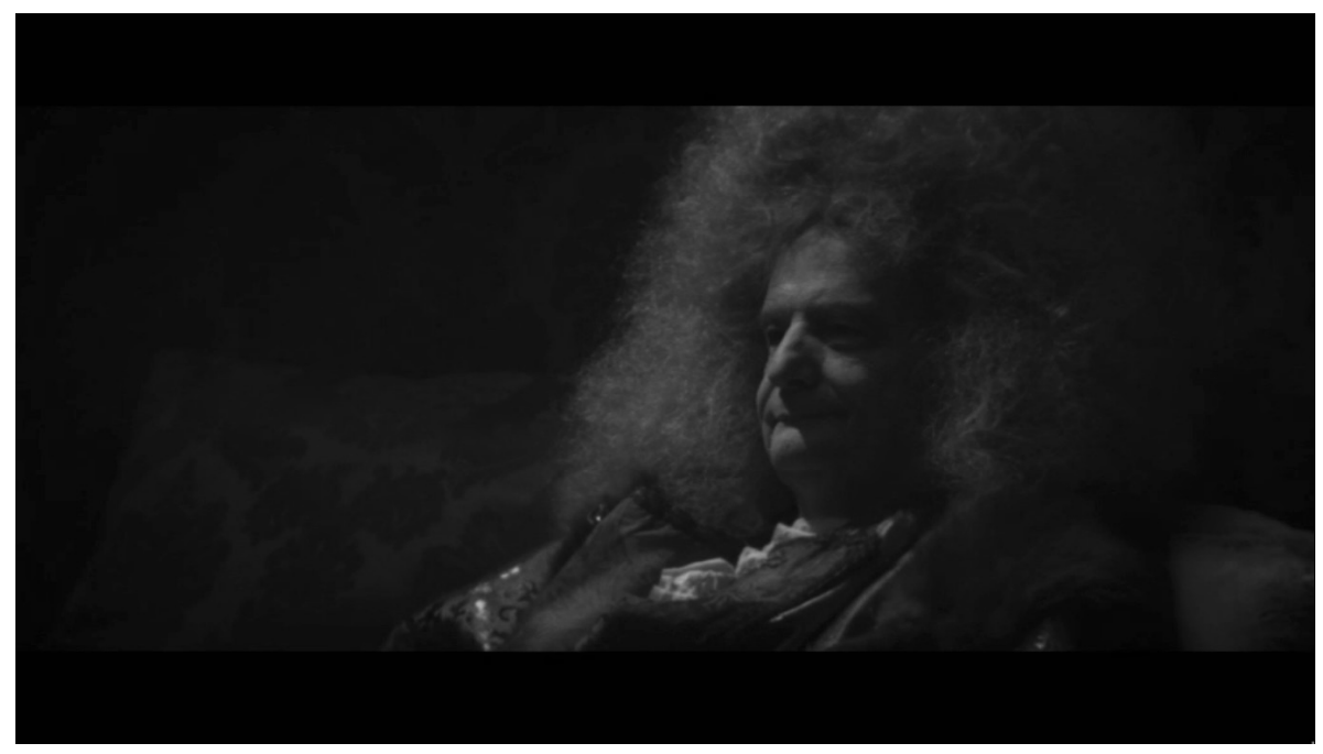
Figure 7. Ladies clap as the King swallows a morsel.

"In its largest sense, affect is part of the Deleuzian project of trying to understand, and comprehend, and express all of the incredible, wondrous, tragic, painful, and destructive configurations of things and bodies as temporally mediated, continuous events. Deleuze uses the term 'affection' to refer