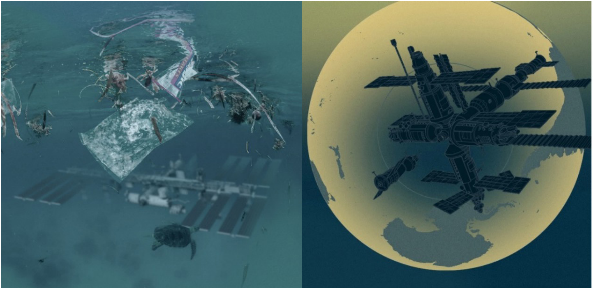
Fig. 4 Illustrations from the Copernican Dive story 10

in mind. Despite the high degree of uncertainty that pervade foreign affairs at the present moment, the recent events in global politics signal a growing awareness about the urgent need to mitigate the effects of climate change. With the apparent alignment of China, European Union, and (just very recently) the United States with the Paris Agreement, and with markets leaning towards green initiatives, this agenda is likely to be more directly involved in multilateral commercial treaties and international affairs as an impending climate governance power, as suggested by economic historian Adam Tooze (2020). In his view, even if the potential new climate power politics does not result in a consolidated consensual vision among sovereign states, companies and corporations that might be seen as a threat to climate stability may be in danger of losing their license to operate. In this scenario, political interventions conjoined with laws, rulings, and regulations are more likely to happen.