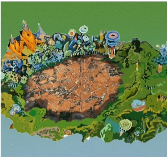
Fig. 1 Illustration from the Moscow Garbage Ring story 3

of Technical Aesthetics' approves a pilot program according to which all waste should be properly reevaluated as secondary raw materials or fertilizers, reducing in 70% the waste in the town. Garbage chutes and specific types of package are also banned in the city, pushing companies to develop technologies for reprocessing raw materials. This hypothetical norm is inspired by a 1960s ecological movement led by local scientists of Pushchino. In the story, the town becomes a national reference for its confluence between sustainable initiatives and research in molecular and chemical biology. The Moscow Garbage Ring is turned into a half-wild park, known for its hybrid landscapes that combine the newborn biomes with conserved centuries-old architecture. Its eco-agricultural ethos includes well-known approaches, such as permaculture, aquaponics, and slow food, but also innovations derived from reprocessing petrocultural commodities.