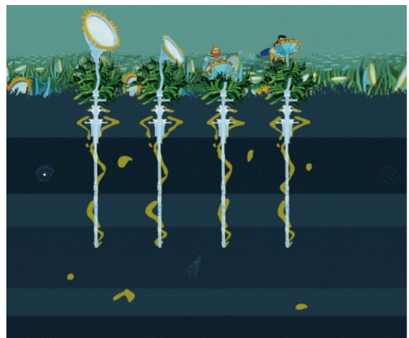
Fig. 2 Illustration from the Deep Sekretiki story 5

a broader organizational setting, with the future foundation of a 'Planetary Emissions Sensing Unit' (PESU) responsible for not only monitoring but also publicizing the largest global data sets about the ongoing effects of climate change. The PESU 'presents' the Russian government with the profoundly compromising climate-crime statistics involving the reckless yet quotidian oil bleedings, and the fossil fuel industry owners are required under federal law to meet the annual international sensing standards, keeping emissions under the established limit of 20%. This story is especially interesting for entangling data sciences, climate journalism, and geoengineering in a same imaginary multi-institutional project.