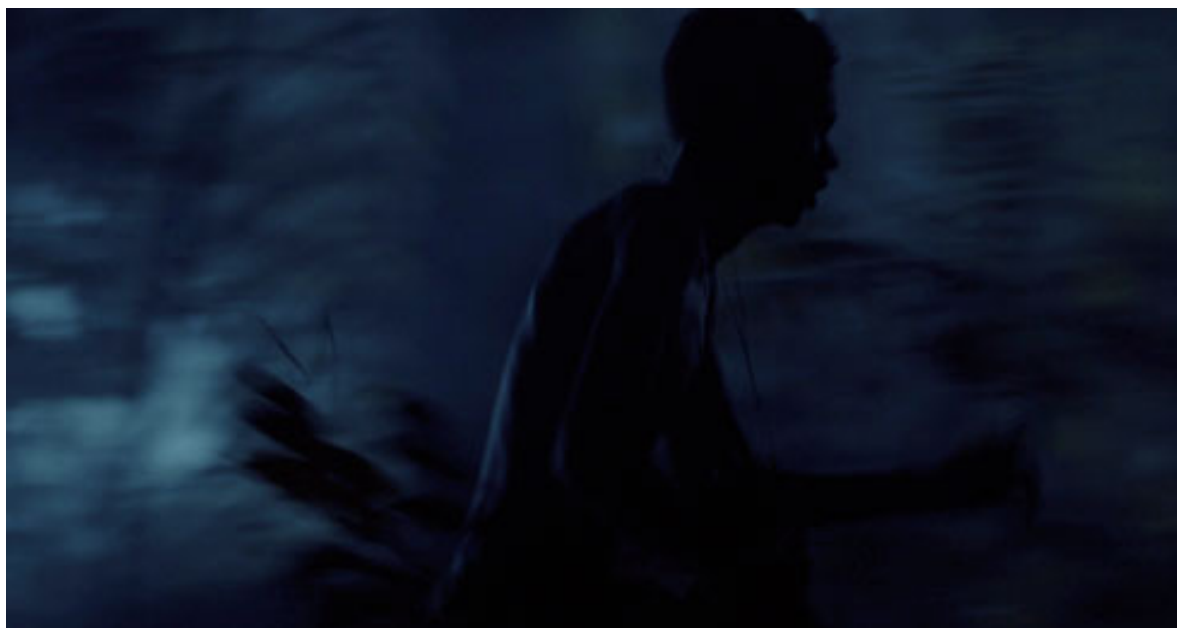
Picture 8 and picture 9- The night at the forest lightened with a ARRI- M18 against the smoke and a lateral 800W for cutting.