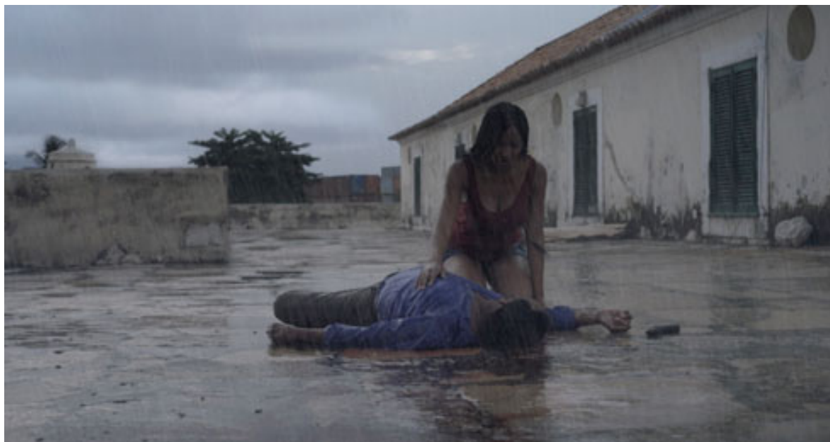
Picture 29 – The final scene of the film is dramatized with rain and stormy clouds and enhanced with artificial rain.