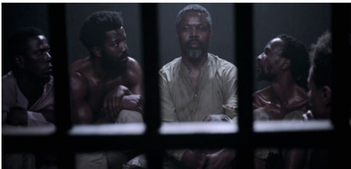
Picture 20 - The intensity of the cell environment where the central character stands out from the group of prisoners. The importance of the wardrobe designed by Silvia Grabowski in contrast with the remaining elements highlights the scene's main character.