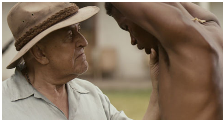
Picture 1-Nicolau Breyner plays the farmer role, the scene in the film which marks the 1950s. In picture 1, the original image and in Picture 2 is warmer and more orange to transmit the ageing feeling.