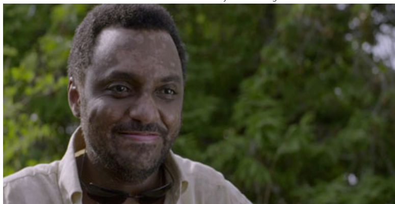
Picture 7– Frame respecting the thirds rule with the camera slightly lower than the height of the eyes, giving him importance and power at the moment he is ordering his men.

situations one needs to operate with the camera at the shoulder, offering a viewfinder with clear sharpness and with the framing marks of our choice, waveform and display where all the necessary information is, without disturbing the field of vision of the camera operator.