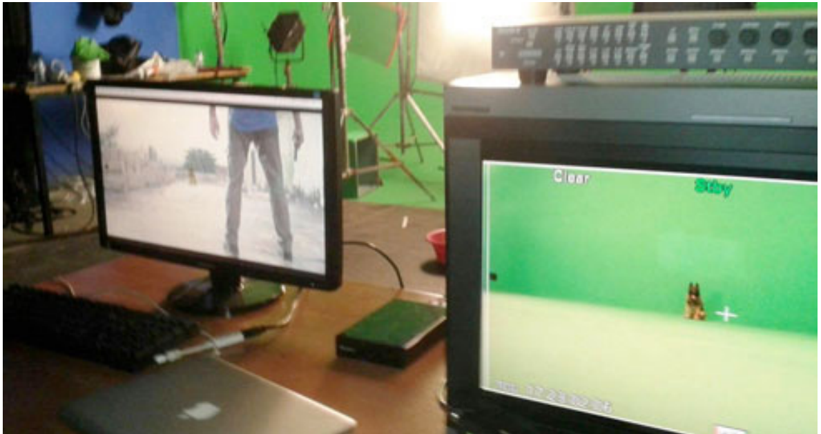
Picture 30 – a picture of the work being developed at the studio recording the dogs in Chroma Key to then introduce in the images collected in Africa.