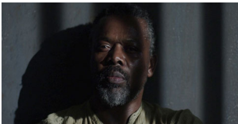
Picture 6– Framed to the centre. Giving relevance and importance to his narrative and the story he is telling us.