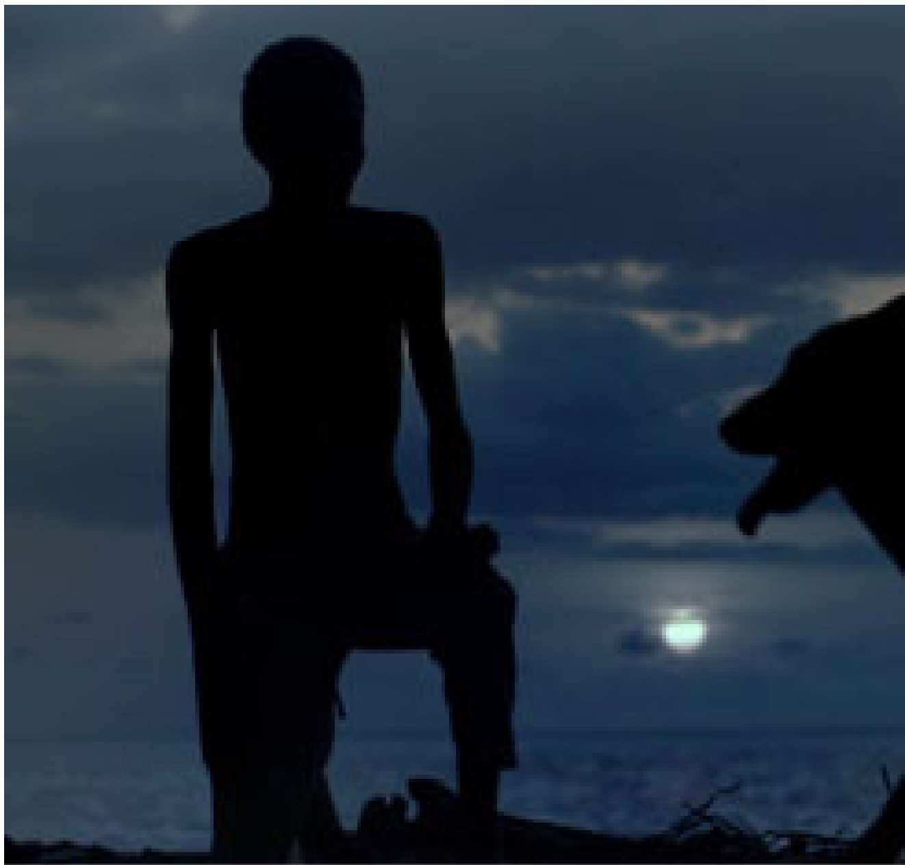
Picture 16 - American night. At the beachfront the clouds were worked by Pedro Louro in special effects as in the inclusion of a dog in the image. The dog was recorded on studio in Chroma Key and Nuno Garcia's colour correction enhanced the clouds and achieved a silhouette. The image was made in broad daylight. In the background it isn't the moon it is the sun.