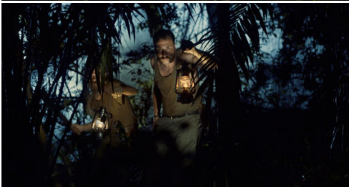
Pictures 12, 13, 14 and 15 - Images of the Forest previous and after the colour correction. It was fundamental to control the waveform at the capture moment. The blacks were too low and here the S-log 3 was fundamental for the exposure, allowing to obtain a larger latitude in the colour and a best signal in the black areas. It's in this particular one that SONY F55 is excellent.