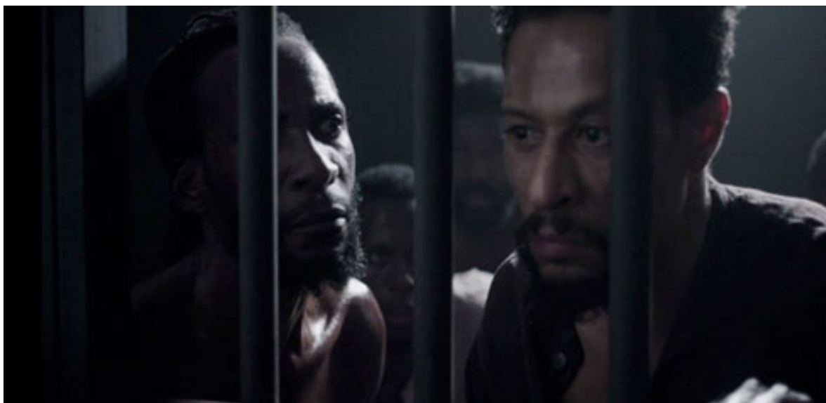
Picture 19– The heavy and intense environment in the cell, created by the light direction and the space darkness.