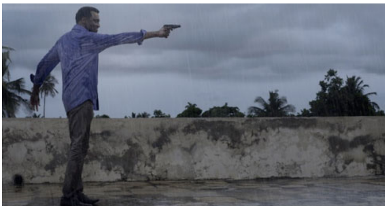
Picture 27- Special effects: in picture 26 the raw image, where a post and electrical cables on the site can be seen and the final image in picture 27. The scene is filmed with rain coming from a hose belonging to São Tomé’s fire fighters and in postproduction more artificial rain was added, as well as the clouds were reinforced to dramatize the film’s last scene.

Special effects by Pedro Louro and Filipe Luz.