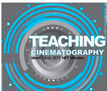
"Teaching Cinematography" Conference poster

Only 6 years have gone by since the fateful year of 2011 and it seems to us that it was a long time ago. Times have changed and both the schools and the image teachers have also had to readapt and learn new ways. Many teachers gave up because they lacked the motivation to learn another technique, others held on to their conviction in defending the film as the best learning method, but all, in general, had to change and adapt to a new era.