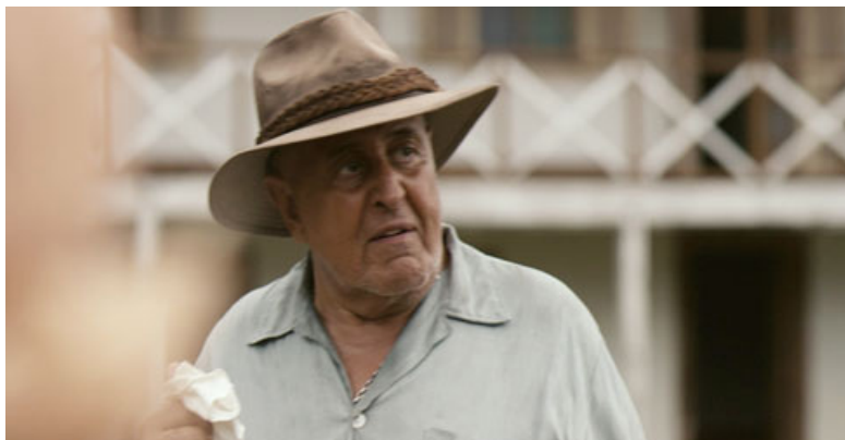
Picture 5- Example of a shot without depth of field. The character stands out from the background and gives depth as three- dimensionality to the image.