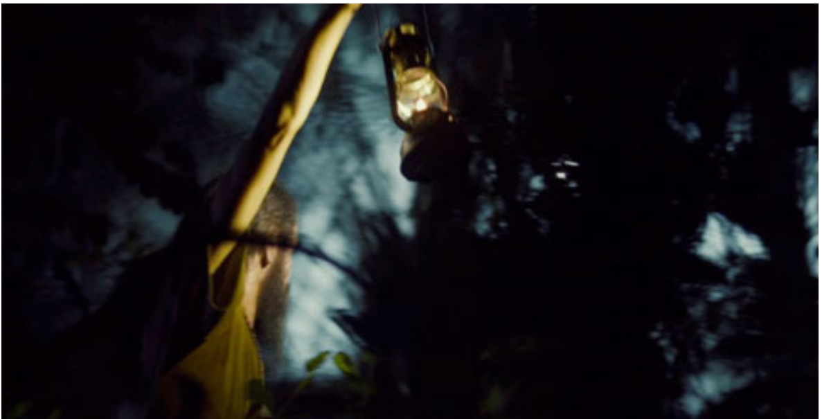
Pictures 10 and 11 - In the two images it can be seen the lightening in the forest made with smoke and an ARRI M/18 in backlight. Lanterns were equipped by Pedro Paiva , the chief electrician, with a LED powered with a battery and covered with a CTO filter to enlighten the face.