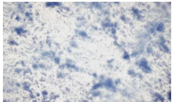
Fig. 14 Known Unto God "Gone for Good" Susan J. Hanna, 2019

The film never returns to solid black between verses, but to a dark moving sludge, the idea being that all the stories and the people appear and disappear into the same viscous base material. The animation reflects the claustrophobia of the poem, there is no time to pause for breath, as a relentless vocal delivery of this list of fatalities demands a visual shorthand. All 2000 images were scratched out with kebab sticks on a backlit glass plate. I used sponges to add oil, water and sometimes vinegar to clay and pigment powder, so the animation process experience itself was tactile and visceral. 3