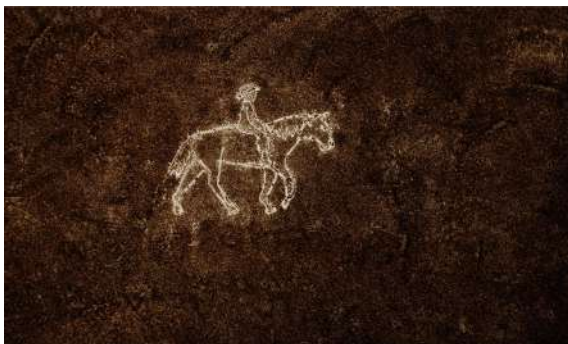
Fig. 1 Known Unto God Verse 1 Susan J. Hanna, 2019

This first verse establishes the innocence and youth of NZ conscripts, and hints at their long journey across the sea to war. Horses pulled heavy guns, transported weapons and supplies, and carried the wounded and dying to hospital as well as mounting cavalry charges. More horses than men died at the Battle of the Somme. Starting in the sea (at Tolaga Bay) and transforming the beach into battlefield mud gave me the opportunity to show the boy in both locations simultaneously. I looked at Otto Dix's powerful images of dead horses, but these capture a static aftermath of battle and the poem is active. One of the challenges from the outset was to keep the animation moving when the poem is all about death.