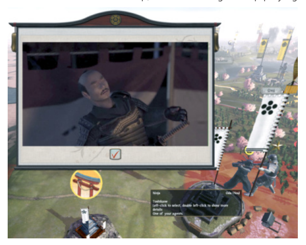
Fig. 2 An assassination pre-rendered cutscene superimposed over the normal game view

The interesting problem TW: S2 makes for itself at the level of the Personal Play Narrative is scaling complexity. At zero-state, the player has to keep track of relatively limited complexity. Her faction's borders are shorter. She has to interact with a limited number of factions. She has few troops, characters, and buildings, and her neighbors likewise. As she plays and succeeds, her faction gains in complexity, she gains more neighbors, and her neighbors get more complex. As turns go on, the system's emergence manifests itself more and more. In drawing from Conversation Theory, the Contract Agency Model requires that the Personal Play Narrative be explainable, and that all understandings be naturally derived from the conversation. The player needs to be able to explain to herself where she ends up, without having to stop playing