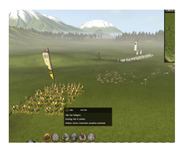
Fig. 4 The player's control being relinquished situationally in the real-time battle map

The mouse and keyboard Controls in the battle map are more involved than in the campaign map. The battle map also is also more involved in terms of Verbs and Tokens. The verb of selecting agents and clicking on terrain or other agents is retained from the campaign map, but the battle map adds real-time clicking and dragging to define facing and rank-depth and frontage for the mass of 3D animated fighters in each unit, as well as different behavior toggles for different unit types. The player can also activate a group toggle for multiple selected units, which offers its own set of verbs. Units react to each other, and to what the opponent is doing and how it continually organizes its troops, and their situation (such as being flanked), terrain (such as fighting uphill), and more.