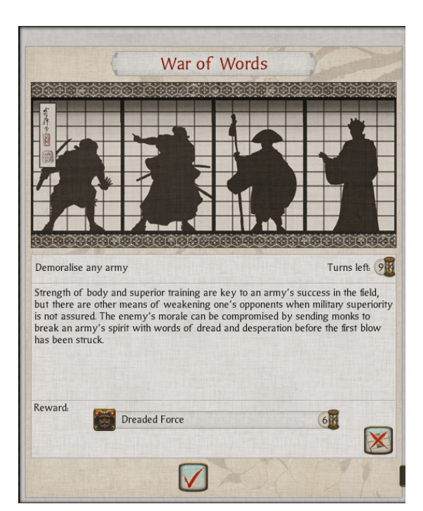
Fig. 3 An interface plane for one of the small quests in S2: TW

The risk to agency from emergent play in TW: S2 is that factors such as population or unrest trend slowly rather than having narratively satisfying twists and turns. The system – the campaign map and its history – can start to drone on, losing the player from the conversation. The system inserts peaks of expressiveness in bio-costs by occasionally offering the player small quests, as can be seen in Figure 3. These can be e.g., taking over a specific settlement or recruiting a particular agent.