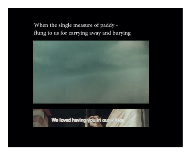
Fig. 3 Screenshot from Contracts of making, viewing and listening, 2019

geared towards juxtapositions, associations, disassociations, comparisons and assemblages. The attempt is to create an interplay between texts and images so that they emerge already inflected by each other and constantly exceed their individual expectations and meanings.