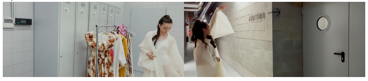
Fig. 11 Stills from sequences (Castelo Branco Moda#19 Fashion Film, Neel Naik, 2019)