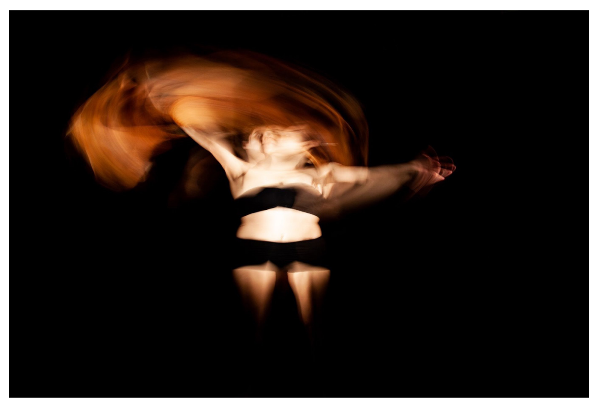
Fig. 4 Still from Kam, 1st iteration.

This hiatus, however involuntary, helped me to approach the material with fresh eyes and to see new connections within the frames. At times, building these connections was guided by the continuity of movement (although part of different gestures); at times, the colour; and at other times, the narrative. It became also clear that the unifying and structuring unit of this film should be the music and the sound design.