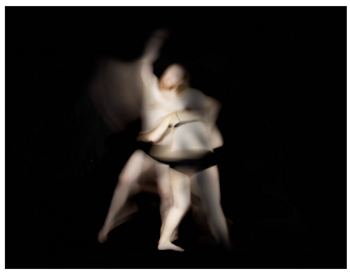
Fig. 2 Still from Instable (Akcay, 2017).

an intermittent "mating dance" in pixilation, integrating static poses intertwined with fluid passages between them (Fig. 2). Inspired by Magali Charrier's Peace Starts with Me (2011) where she used the long-exposure technique combined with ink drawings to create a dissociated, transforming and recomposing sense of body in the dancer, I initially conceived Kam around highlighting the body as a transitioning entity via the interplay of static and fluid poses, enabled by long-exposure pixilation.