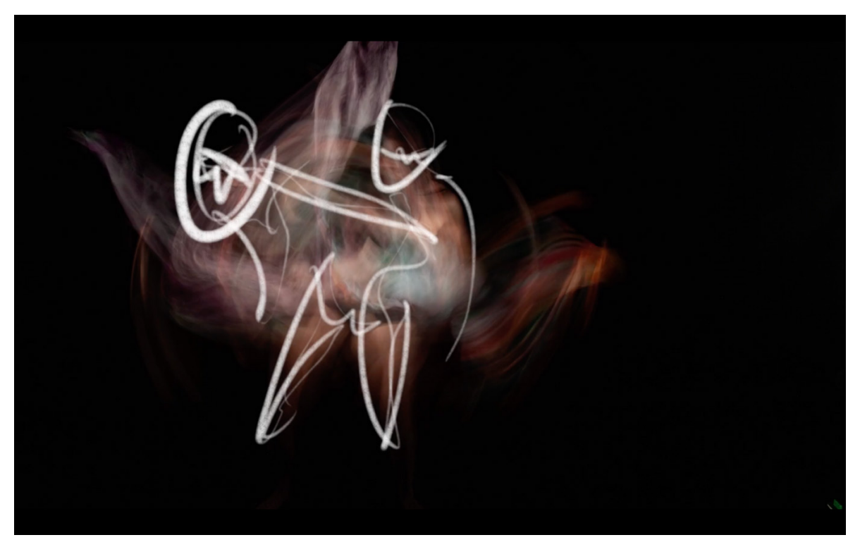
Fig. 9 Still from Kam, 2nd iteration.

Animation's capacity of creating this pre-logic state existing "beyond good and evil" is the main reason behind Eisenstein's fascination with Disney cartoons. According to him, in the Disney world, everything is bound to "one's fantasy and will.... a world of lines and colours which subjugates and alters itself to your command. You tell a mountain: move, and it moves. You tell an octopus: be an elephant, and the octopus becomes an elephant. You tell the sun: "Stop"—and it stops" (Eisenstein, 1986, p. 3). He calls the capacity of these defined forms to transform into other defined forms at any time as "plasmaticness" for they contain the potential of a "primal protoplasm, not yet possessing a 'stable' form, but capable of assuming any form" (Eisenstein, 1986, p. 21).