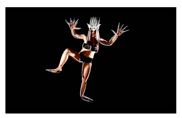
Fig. 7 Still from Kam, 2nd iteration.