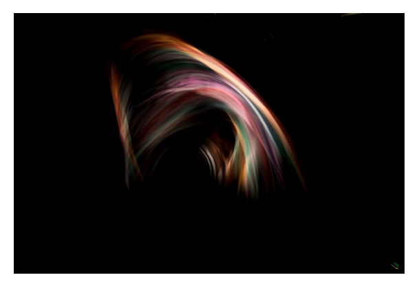
Fig. 5 Still from Kam, 1st iteration.

This position led me to determine possible moments of intervention: similar to a stream of consciousness, the drawings were sometimes inspired by the traces of movement, sometimes by the specific rhythm in the music, and sometimes, by the narrative intentions. For example, at 02m02sec, the lines follow the scarf's trajectory and complement it in an explosive way within the frame (Fig. 6), in line with the music's beats, while at 24sec, when the dancer poses like a" monster", the lines depict a naked shaman with long nails superimposed with the dancer's image (Fig. 7), augmenting and amplifying the pose's underlying emotion. At 50sec, after the dancer disappears, the lines become independent and take the stage