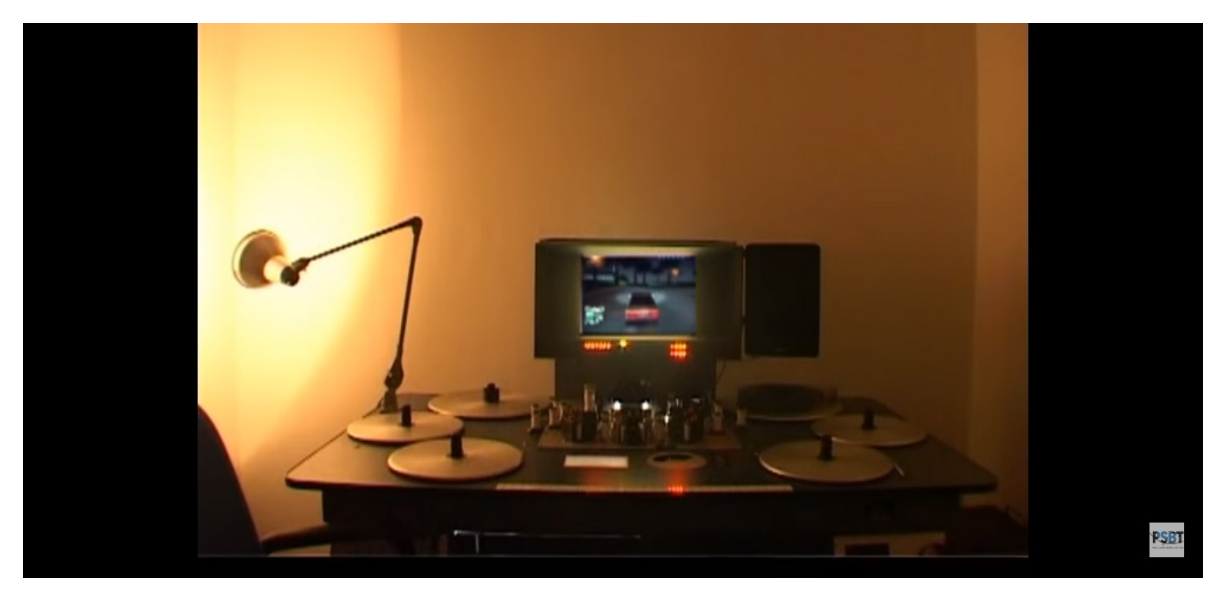
Fig. 8 © Deb Kamal Ganguly

Deb Kamal Ganguly, Ex-faculty Film and Television Institute of India, Pune