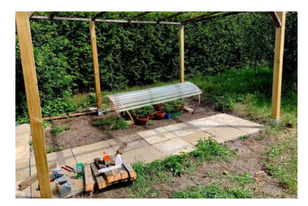
Fig. 5

Uncertain times inspire the resurrection of narratives thought to be once outdated. These have been reproduced again and again, ever since Griffiths' Birth of a Nation - I call this "milestone" in film history Birth of Discrimination . Myths from a heterosexual matrix and the binary notion of male vs. female, good vs. evil, white vs. black promise order in a time of increased and escalating uncertainties.