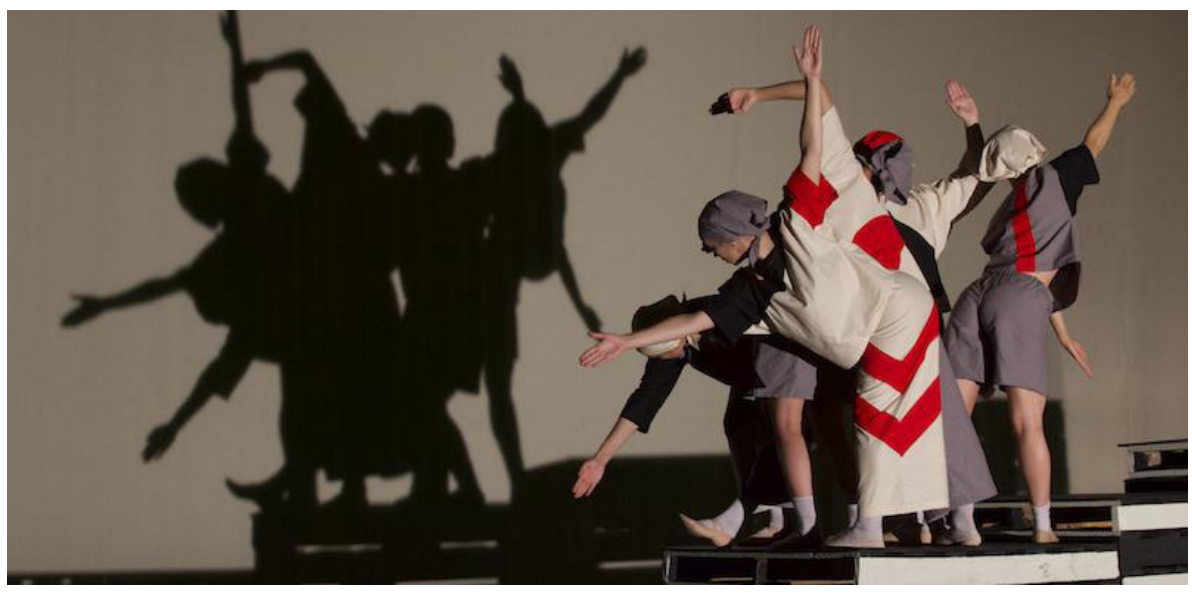
Fig. 7 The-Physical-TV-Company, 2019