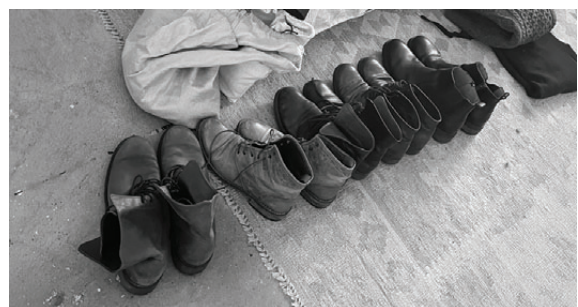
Fig. 24 Costume details, 2023

The manuscript is based on documentary strategies in a porous overlap of fiction and reality. In the script process, our methodological framework practice Exploratory retelling, draws from performative writing; addressing the unconscious, imagination, dreams, the unsaid; acknowledging that writing occurs from and through a body. It narrates personal lived experiences on a sliding scale of fabulation, characterized by unpredictable dialogue and kinesthetic triggers, challenging causality through montage techniques. As an embodied practice, the scriptwriting connects with rhythmic and poetic concepts of choreography.