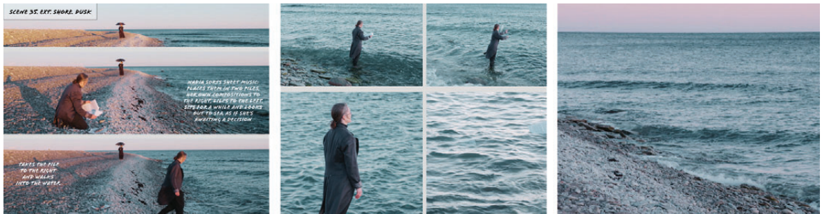
Fig. 32 The Sisters B.; stills from footage, excerpts from script, 2023

event, an absurd venting moment for a bored crew. The scene provides footage that can be edited as interjections of consciousness' shadowy corners, fantastical detours or echoes of the unsaid.