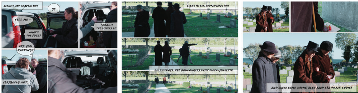
Fig. 11 The Sisters B.; stills from footage, excerpts from script, 2023