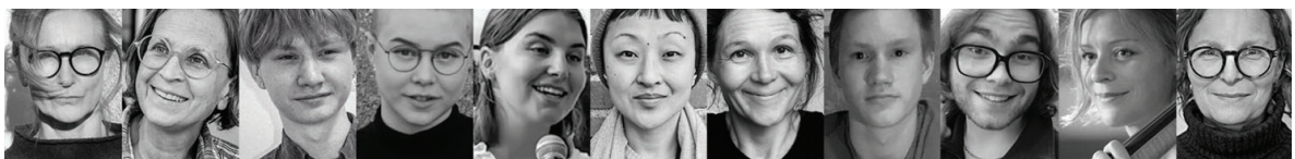
Fig. 35 The film cast and crew, 2023

A film is in the making – format and duration unknown – grounded in embodied experience of the collaborative filming week. Kersti edits; a Tinkering practice of montage based on articulated oscillation between three perspectives: the character's, the filmmaker's and the viewer's. This embodied shifting of cinematic positions, draws from Kersti's original editing taxonomy in relation to shaping character through editing (Brennan & Pearlman, 2023).