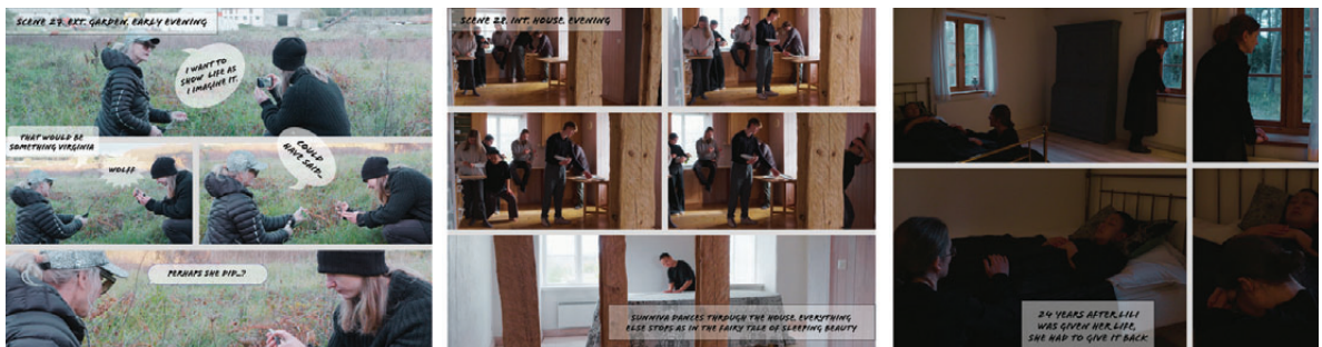
Fig. 28 The Sisters B.; stills from footage, excerpts from script, 2023

In the ethical considerations around re-composing Lili's work, we weigh the integrity of the composition against its performability within the project. We use re-composition as an embodied montage strategy; composition fragments – a harmony, a rhythmic pattern, a piece of melody – are re-assembled as montage and embodied in the footage and the performers through their playing of the music. The practice of re-composition takes the 1917 music to a different time with different conditions through both Perform-acting and Exploratory retelling.