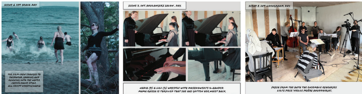
Fig. 8 The Sisters B.; stills from footage, excerpts from script, 2023

The parents had lost their firstborn, Nadia and Lili's younger sister dies as a baby, and Ernest dies when the sisters are still small. Both sisters get a formal music education and through their mother's legendary salons they become part of Paris' music community.