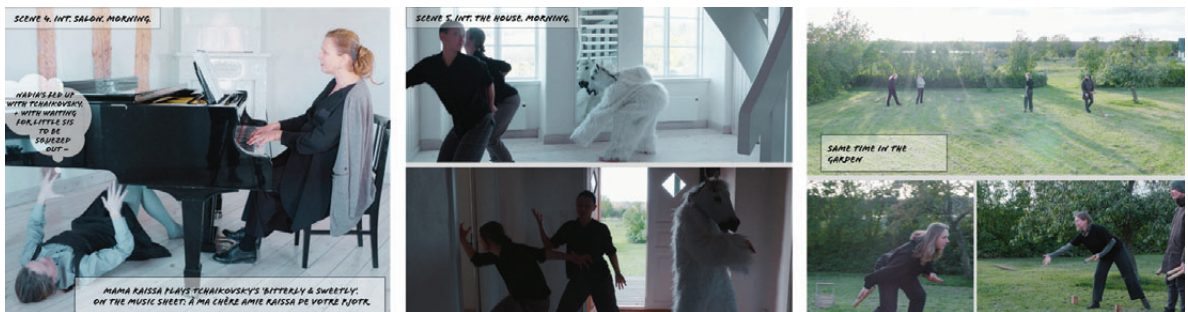
Fig. 6 The Sisters B.; stills from footage, excerpts from script, 2023