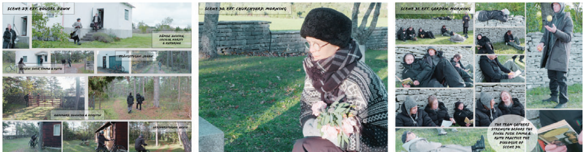
Fig. 30 The Sisters B.; stills from footage, excerpts from script, 2023