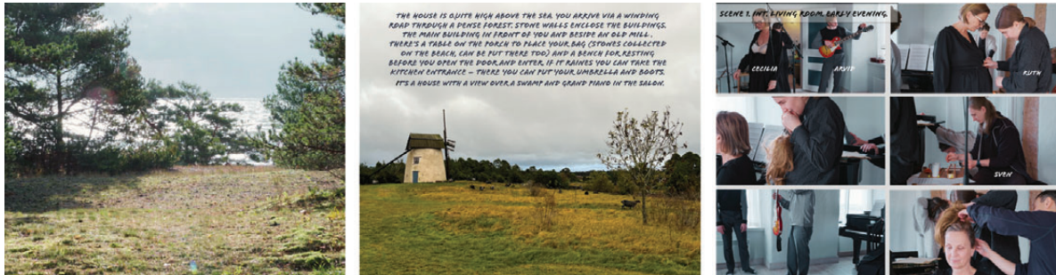
Fig. 2 The Sisters B.; stills from footage, excerpts from script, 2023.