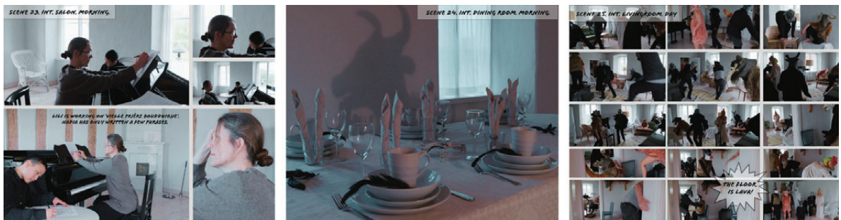
Fig. 26 The Sisters B.; stills from footage, excerpts from script, 2023