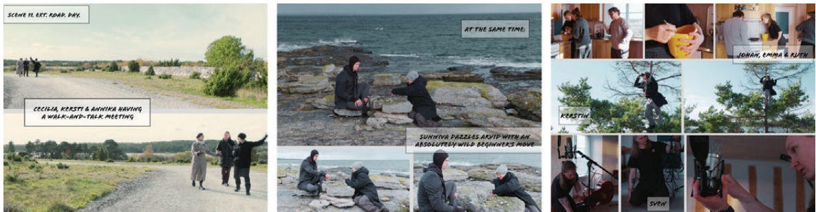
Fig. 12 The Sisters B.; stills from footage, excerpts from script, 2023

of the risk of implementing a tyranny of harmony where friction and tension is banned from the process.