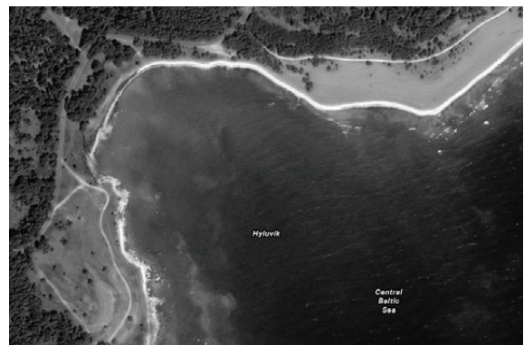
Fig. 13 Satellite view of filming location, 2025

We have another go at it. But before we start, the two of us assess other scenes scheduled this day, efforts of changing locations and acknowledge yesterday's discord by taking responsibility for our own emotional responses to the conflict. We find new connections to the scene and each other, then rethink the wider shots' image composition with the water diagonally behind Lili.