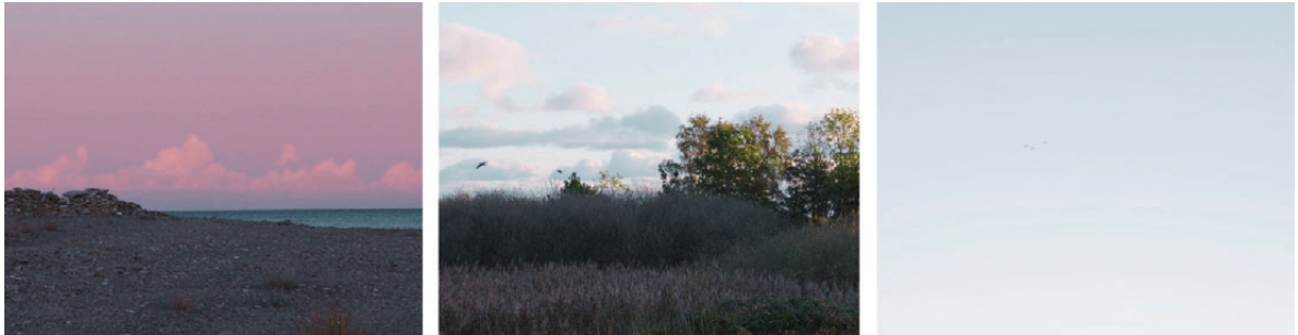
Fig. 34 The Sisters B.; stills from footage, excerpts from script, 2023