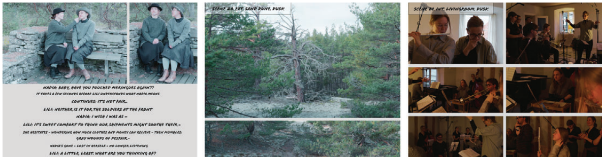
Fig. 23 The Sisters B.; stills from footage, excerpts from script, 2023

Two scenes later, Johan, Emma and Ruth make pancakes, scene 9 still reverberating through their whisking and flipping. Embodied montage strategies for scriptwriting bring the doing to the forefront.