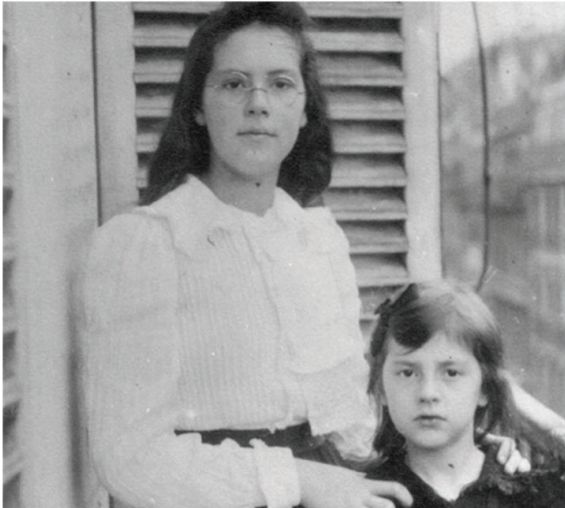
Fig. 1 Nadia & Lili Boulanger, Paris 1900

The Sisters B. project continues the research trajectory described in The BLOD Method: case study of an artistic research project in film (Boholm & Grunditz Brennan, 2022). The BLOD method is articulated as a ten-point Manifesto, written to accommodate a multitude of contents, forms, and modes of collaboration, while demanding cross-disciplinarity, honesty and risk-taking. Aiming to create multivocal cinematic experiences on themes of female bleeding, bodily transformations, and vulnerabilities, BLOD explored a kaleidoscopic dramaturgy using juxtaposition and kinesthetic engagement as compositional tools, pointing towards a potential of combining embodied and montage.