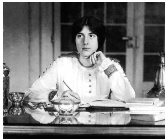
Fig. 10 Lili Boulanger, Paris ca 1916