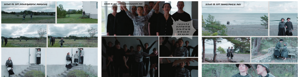
Fig. 21 The Sisters B.; stills from footage, excerpts from script, 2023