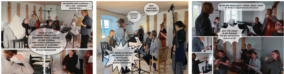
Fig. 9 The Sisters B.; stills from footage, excerpts from script, 2023