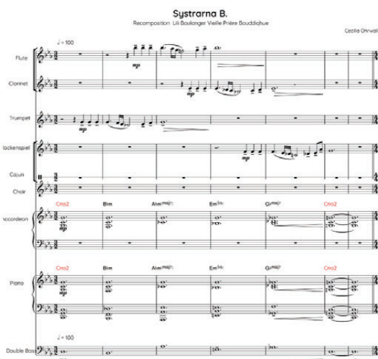
Fig. 29 Page from score of re-composition, 2023

With the extensive footage of preparations we already have from scene 1 and 8, we dedicate the rest of the day to filming the ensemble playing.