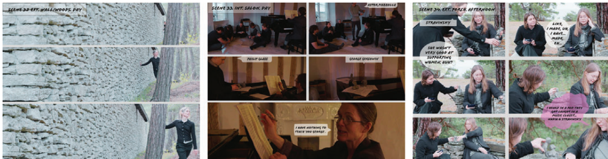
Fig. 31 The Sisters B.; stills from footage, excerpts from script, 2023

Reading from a paper changes the character from someone who can pull eloquent phrases out of the moment into someone who has laid awake to find the words. This interaction between actor, director, conditions and physical action cooperate when creating a performative image to counter the prevalence of skilled impromptu orators in cinema.