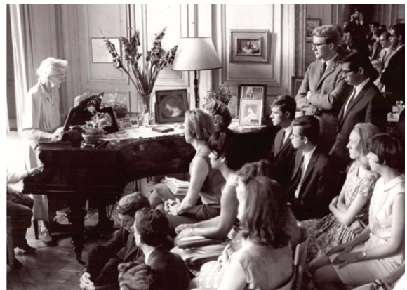
Fig. 33 Nadia Boulanger with students, Paris late 1960s

This October week offered woods full of Craterellus tubaeformis. Left the hamlet at dawn, crossed a road, started picking. Walked further, squatted and picked. Saw another cluster, went there. Turned around, saw the spot just left from a new angle, saw mushrooms missed. Needles in boots, fingers smelling of funnel chanterelle and moss.