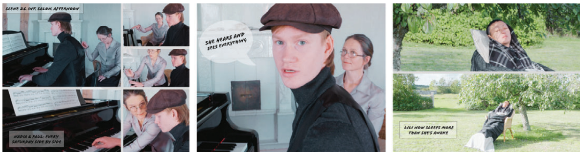
Fig. 27 The Sisters B.; stills from footage, excerpts from script, 2023