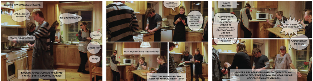
Fig. 4 The Sisters B.; stills from footage, excerpts from script, 2023

The Sisters B. experiments with the BLOD method applied to a project with more people and less time, prompting strategies for navigating friction and care in both collaboration and narrative. Embodied montage strategies for idea development are as much about story and form as about creating structures for a process that supports creative agency in all cinematic practices through the entire production and allows an aesthetic to emerge from conditions at hand.