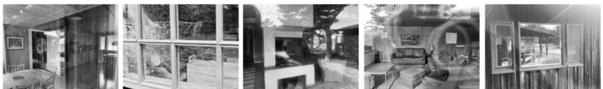
Fig. 18 Filming locations Hammars, 2023

(to SVEN:) Wolff (pause) could have said... perhaps she did...?