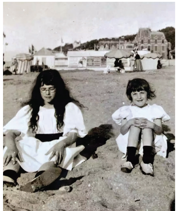
Fig. 5 Nadia & Lili Boulanger, Trouville 1902

queries, this project takes on aesthetic challenges in this age of climate crisis. We argue that sustainable filmmaking requires new strategies and a belief in the audience’s imagination: Fårö can act as France, the Baltic Sea can perform the Atlantic.