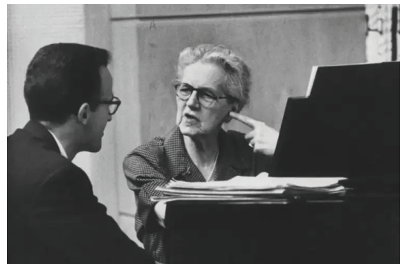
Fig. 22 Nadia Boulanger with student, USA 1958

Nadia started teaching young and she became one of the most influential composition teachers of the 20 th century. Composer and critic Virgil Thomson, famously dubbed her "a one-woman graduate school so powerful and so permeating that legend credits every American town with two things – a five-and-dime and a Boulanger pupil." (1962)