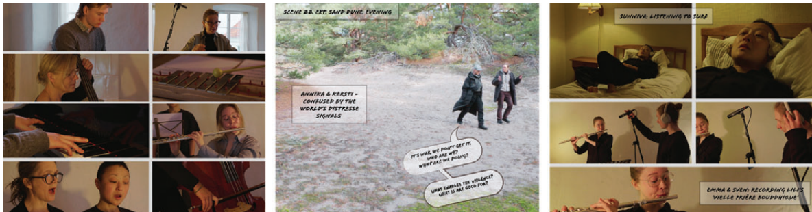
Fig. 25 The Sisters B.; stills from footage, excerpts from script, 2023

The third to last scene in the script epitomizes embodied montage strategies – starting from historical fact to envision a situation of tactile and material actions, dislocation, anachronism.