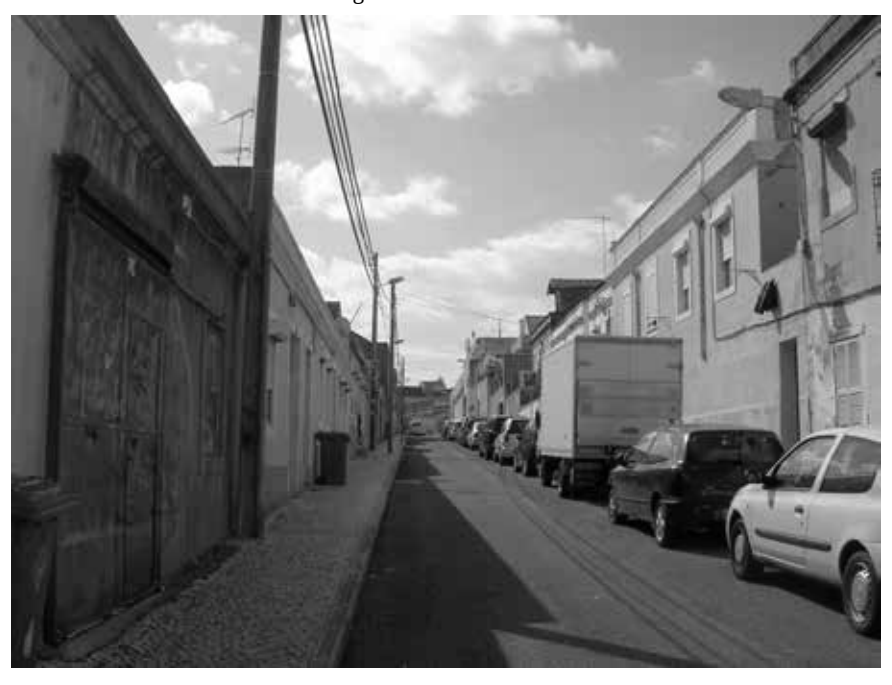
Fig. 2- Centieira Street

This street had its traditions and activities. They were driven by the Recreational Group Centieirence, founded in 1948 with had the objective of promoting the interaction between residents and organize entertainment events: festivals, football, theatre, fado... There was a large involvement between the population and a great spirit of neighborhood. There were also more residents at that time. Now several houses are vacant. (Xavier, 2013; Xavier, 2014).