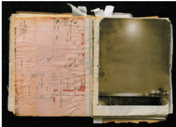
FIG 1: Dymaxion Chronofile

decision scarcely to speak, in order to be certain of the meaning of the words he was saying. "I had to disconnect everything, so as to be able to begin to think by myself." 6 It was therefore from his experience that he would draw his reflections and innovations. He created a sort of logbook, to which all his reflections and experiences were consigned, and he assembled in it a very important mass of information that was as diverse as it was varied. He called it the Dymaxion Chronofile 7 , Catalogue of the resources of the world, of the great orientations and of the needs of humanity.