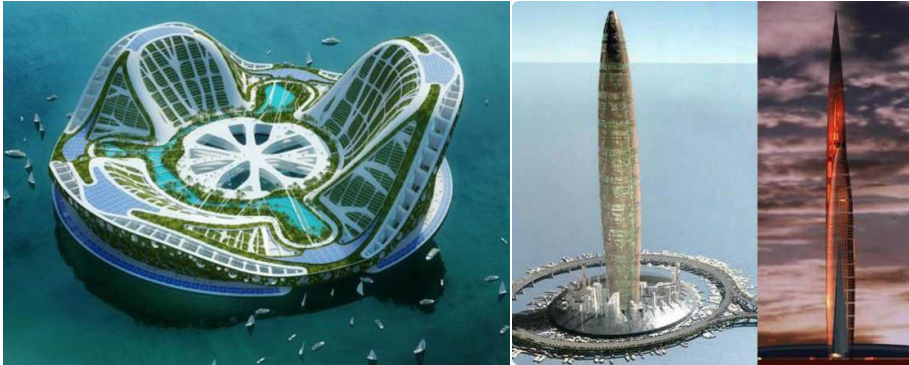
Figure 1: Floating cities, www.gizmag.com Figure 2: Bionic Tower , aedesign.wordpress.com