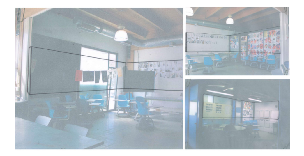
Figure 3 – Proposed screen placement at DELLI area.

Another more straightforward idea was to use a projector that could influence only a wall, which limits the concept of a surrounding environment. Still, it could serve as a starting point to access some attributes as the automatic adjustment based on heart rate frequency. A draft is presented in Figure 4. In this we can have a general view of the web-based information manager created by the students, that users can use for both scenarios – classes and as inspirations.