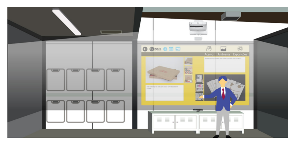
Figure 4 – One Wall solution with ceiling laser projector and movement sensors. The web-based solution is projected at the wall.