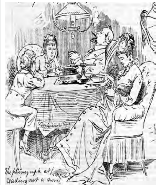
Figure 2. "The phonograph at home reading out a novel." From "The Papa of the Phonograph," Daily Graphic (New York), April 2, 1878, 1 (The Western Reserve Historical Society, Cleveland, Ohio).

The device known as the radio became an element of globalisation and also of the miscegenation of music genres, by the time fragment and by the diversity, basic qualities of the gramophone and the radio, which Adorno will criticize regarding their effects, namely, the fetishization of music as commodity and the «regression of listening» which finds its support in popularisation and distraction ( On the Fetish-Character in Music and the Regression of Music , 1938).