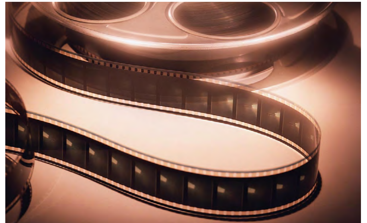
Figure 3. Motion Picture Film

This vanishing of the medium, a dematerialisation, fosters a partial detritorialisation which re-establishes the notion of space and time. Historically, if we take from this relation the material components, the media have always been invented for unique functionalities. Each device had, at birth, so to speak, a primary function which, as we know, was gradually