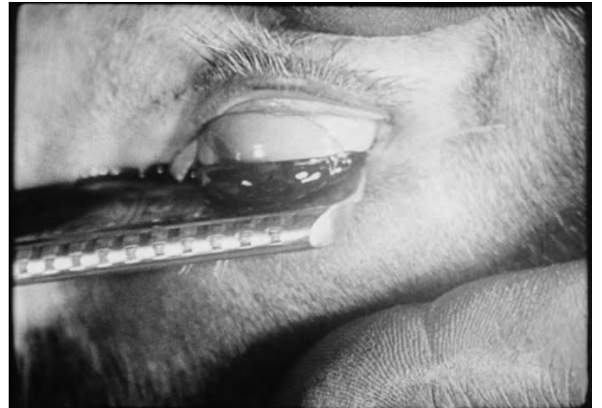
Figure 1. Image of «Un Chien Andalou», by Luís Bunuel and Salvador Dali, 1929.