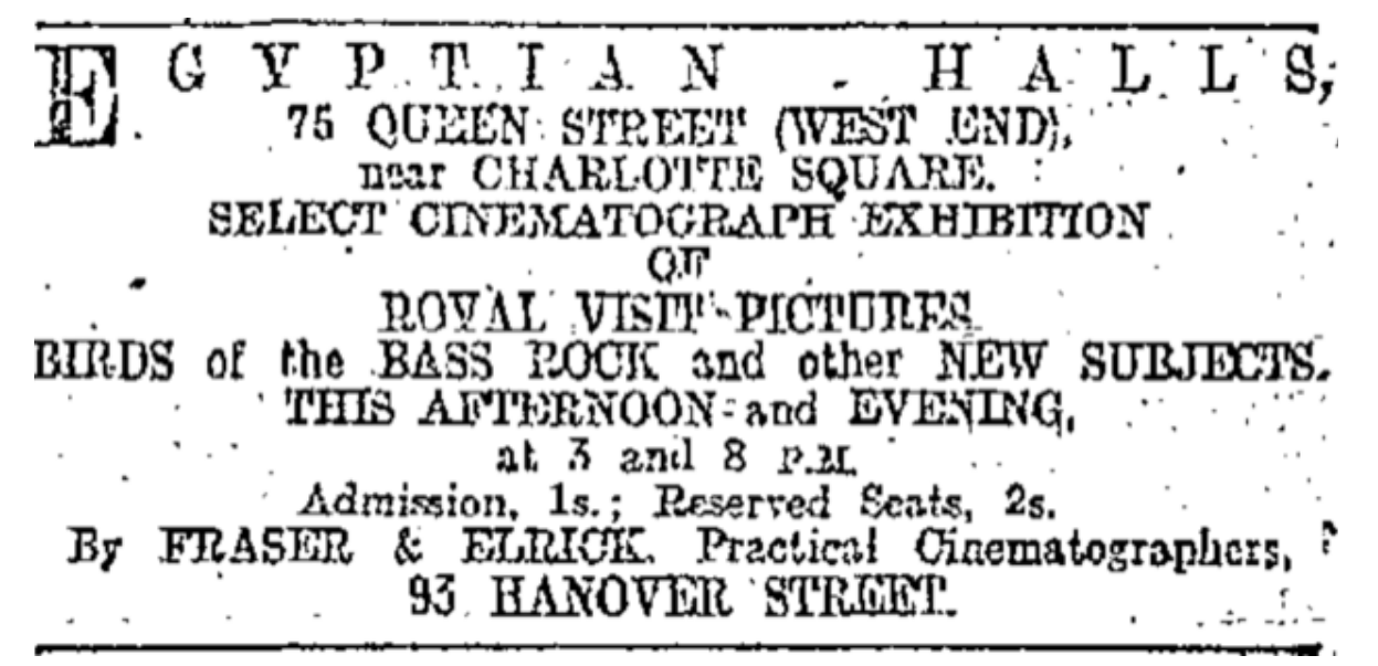
Fig. 1 Advertisement for a film exhibition by Fraser & Elrick, with Birds of the Bass Rock a principle attraction (The Scotsman, 25 May 1903, p. 1).