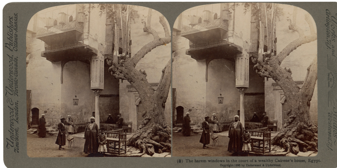
Fig. 5 (9) "The harem windows in the court of a wealthy Cairene's house, Egypt," 1896, Underwood & Underwood stereoview. Private collection.

The reader draws from this text that Breasted believes the downfall of Egypt was due to the introduction of Islam in Egypt – crushing the greatness of the past and causing its culture to become stagnant and backward.