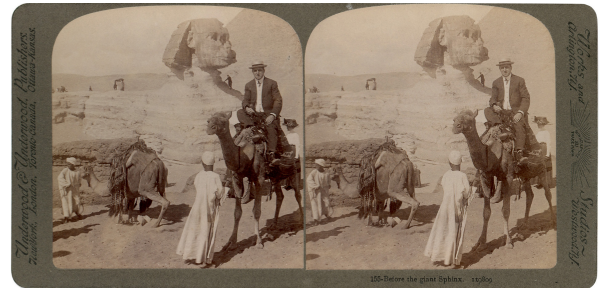
Fig. 1 "Before the giant sphinx," n.d., Underwood & Underwood stereoview. Private collection.

The opening of the Suez Canal in 1869 expanded tourism and commercial photography opportunities in Egypt and many countries in Asia (Pérez González, 2014, p. 30; Osman, 1997). In the mid-1870s, the travel company Thomas Cook & Sons transformed tourism by operating steamships up and down the Nile from November to March, providing luxury services for Western tourists along with a network of guides, porters, and servants across Egypt. Tourists were able to purchase inclusive package tours that offered easy travel experiences. In the nineteenth century, the Egyptian tourism industry primarily served British tourists, whose tourist gaze consisted