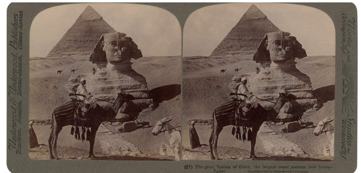
Fig. 2 (27) “The great Sphinx of Gizeh, the largest royal portrait ever hewn—Egypt,” 1896, Underwood & Underwood stereoview. Private collection.

While the chapter “The Story of Egypt” is formally written, the “Itinerary” chapter, which forms the actual tour, is written more informally, as if Breasted is casually talking to his readers. Breasted’s tour begins in Alexandria at Pompey’s Pillar. It proceeds to Cairo to visit the Egyptian Museum and