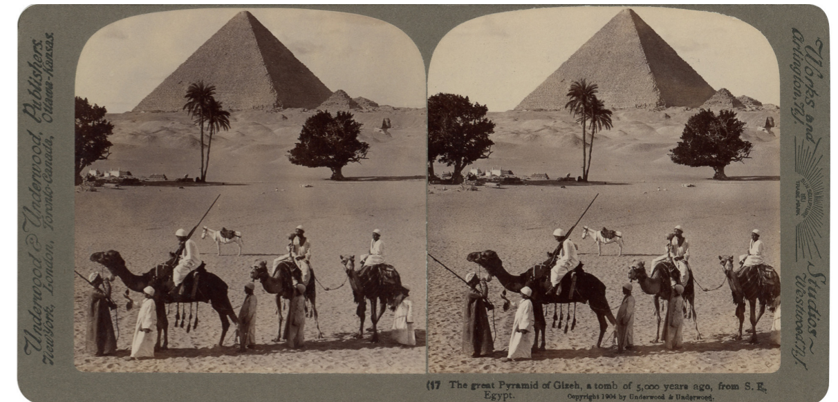
Fig. 4 (17) "The Great Pyramid of Gizeh, a tomb of 5,000 years ago from S.E. Egypt," 1904, Underwood & Underwood stereoview. Private collection.

Position 17, "The Great Pyramid of Gizeh, a tomb of 5,000 years ago from S.E. Egypt" (Figure 4), reaffirms that interpretation of Breasted's text. In this view, a group of young Egyptian men wearing traditional clothing congregate and chat among themselves. Three of them sit on camels, while the