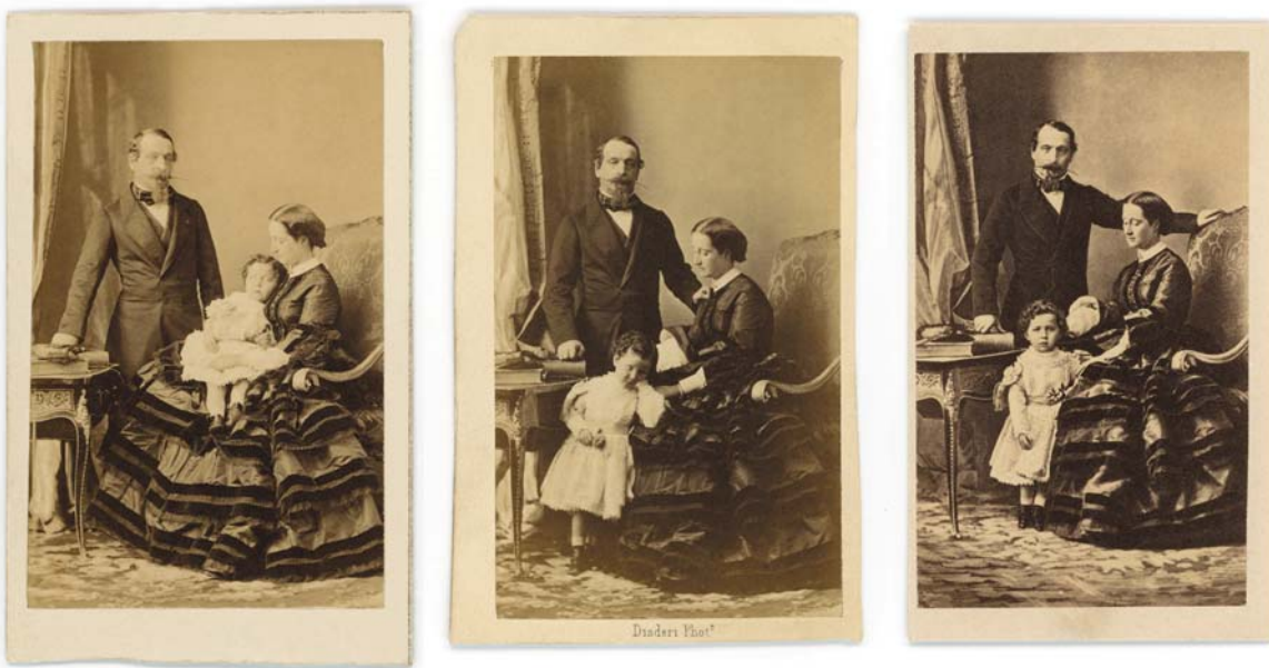
Figs. 09a, 09b and 09c André Eugène Adolphe Disdéri. Carte-de-visite portraits of the Imperial family. May 1859. Author's collection.