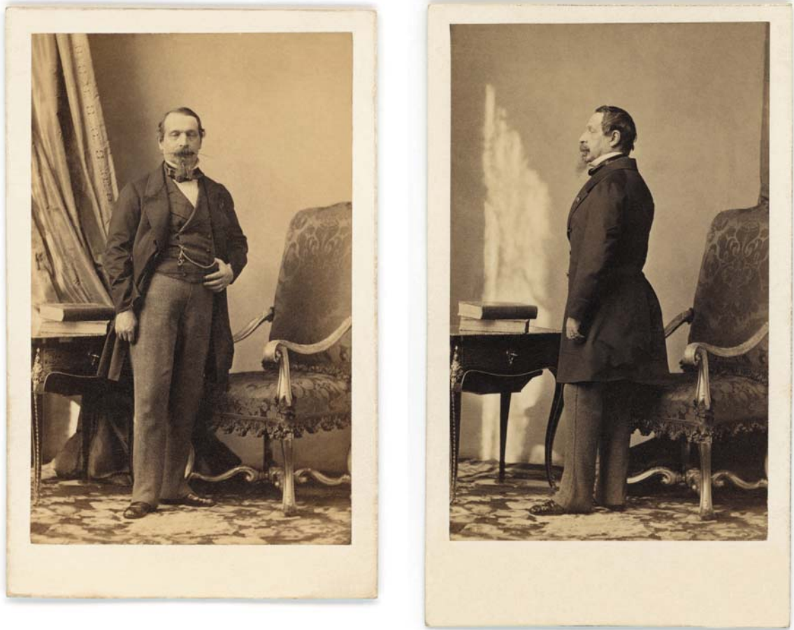
Figs. 05a and 05b André Eugène Adolphe Disdéri. Carte-de-visite portraits of Emperor Napoleon III. May 1859.