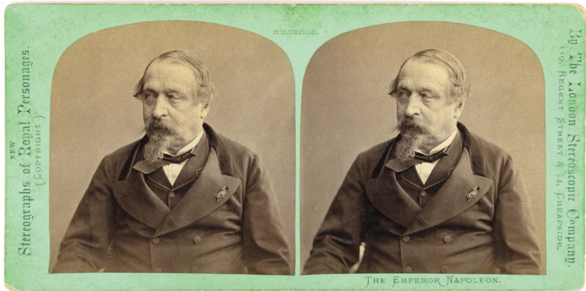
Fig. 14 London Stereoscopic Company. Stereo card. "Photograph of the Ex-Empoleon Napoleon head & bust \frac{3}{4} face looking to his right." 1871.

Of late there has been a conflict of testimony as to the physical appearance of the Emperor Napoleon; and some little time ago I made a statement in this column on that subject, which I had received from trustworthy authority. It is now in my power to state from personal observation something on this point, which is, that beyond having lost what may be called the compactness of countenance which used to characterise him, and a lessening of the firmness of expression, the Emperor does not show much facial deterioration, or, at any rate, not as much as might have been expected. As to his hair, it is undoubted that it is very gray and in scarce quantity. The London Stereoscopic Company have recently taken some