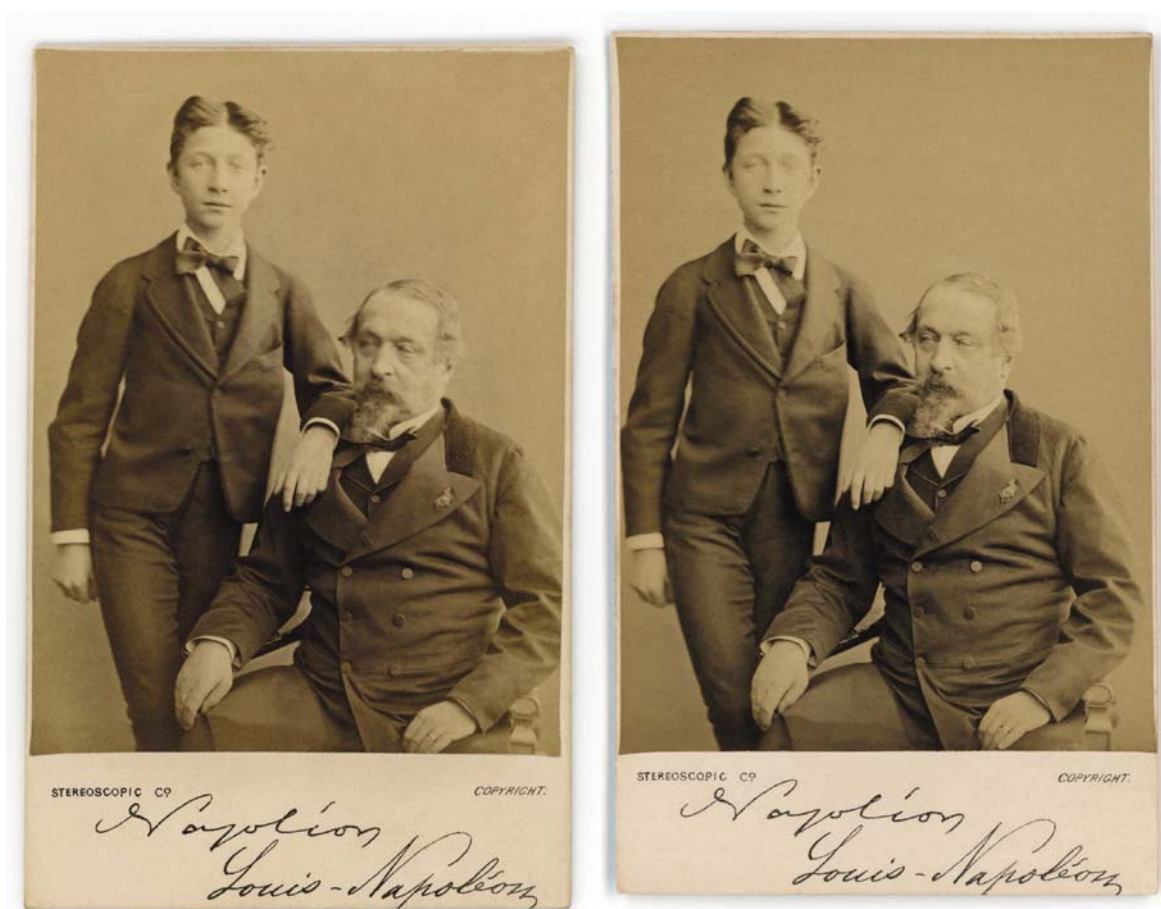
Fig. 15 London Stereoscopic Company. "Photograph \frac{3}{4} length group of the Ex-Emperor Napoleon seated \frac{3}{4} face, and the Prince Imperial standing full face". 1871. The images of the Emperor and of the Prince imperial were also published, from the same negatives, as cartes-de-visite. Since the left and right halves of the original stereoscopic pair were used to obtain those prints it is not impossible to find the two different photographs, align them properly, and reconstruct the stereo card. Author's collection.