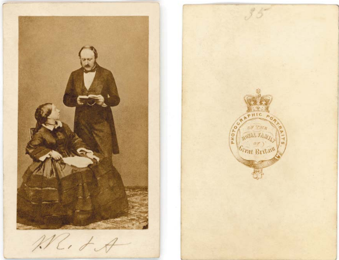
Fig. 11 John Jabez Edwin Mayall. Royal Album. "V. R. & A." (Victoria Regina & Albert). Front and back. Author's collection.