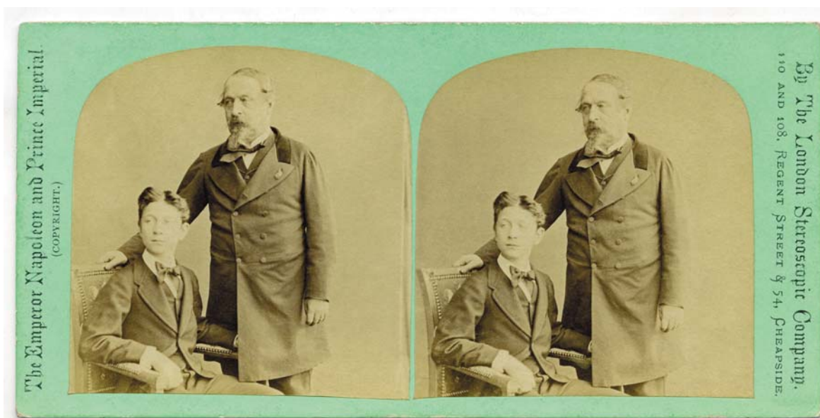
Fig. 13 London Stereoscopic Company. Stereo card. "Photograph \frac{3}{4} length group of the Ex-Empress Napoleon standing \frac{3}{4} face, and the Prince Imperial seated nearly full face looking to his right." 1871. Brian May Archive of Stereoscopy

reflective face, not destitute of goodness; and has in it an expression of suffering, which not even the buoyancy of youth has apparently been able to conquer. In a few days these portraits will be spread broadcast over the land.