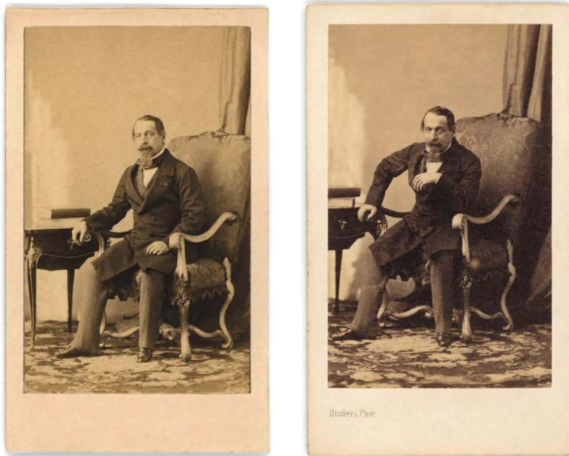
Figs. 06a and 06b André Eugène Adolphe Dideri. Carte-de-visite portraits of Emperor Napoleon III. May 1859. Notice how the Emperor looks less stiff and far more relaxed in the right-hand side image.