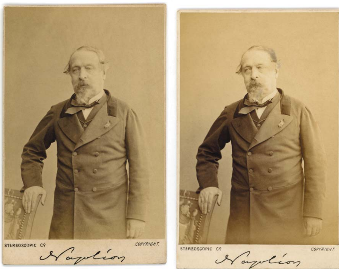
Figs. 16a and 16b London Stereoscopic Company. "Photograph of the Ex-Emperor Napoleon \frac{3}{4} length standing full face." 1871. These two images are actually variants of the same pose. In the left-hand side image the Emperor is looking straight ahead, in the right-hand side one his head has hardly moved but his eyes are looking to the right. When the two images are properly aligned one gets an interesting stereoscopic effect. Author's collection.