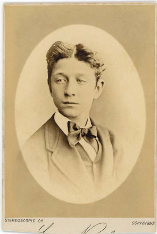
Figs. 17 London Stereoscopic Company. "Photograph of the Prince Imperial head and bust nearly full face looking to his right" 1871. Author's collection.

I must say I cannot look at these images without some sadness. Whatever the journalists wrote, the Emperor looks old and tired, although he tries hard to put on a jolly and optimistic countenance. The idea behind this hastily arranged