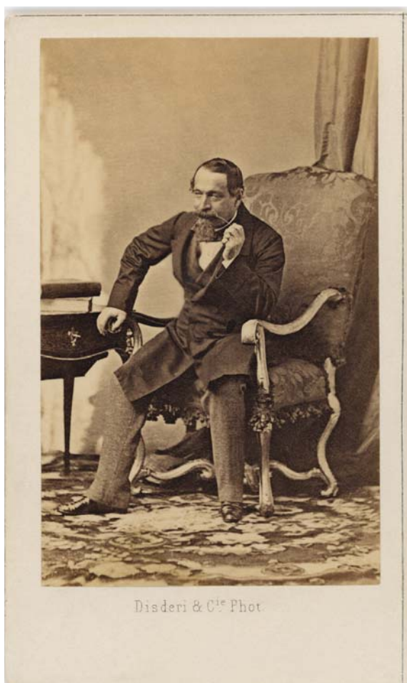
Fig. 07 André Eugène Adolphe Disdéri. Carte-de-visite portrait of Emperor Napoleon III twisting his moustache. May 1859.

On the other side of the English Channel, it was also the monarch, Queen Victoria, who, following in the footsteps