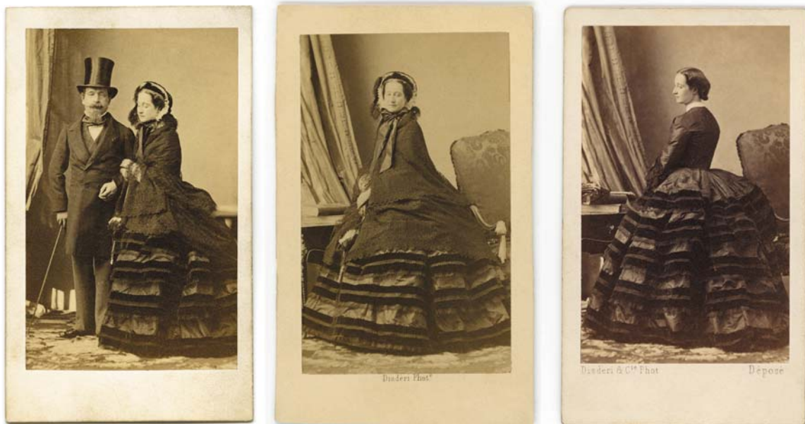
Figs. 08a, 08b and 08c André Eugène Adolphe Disdéri. Carte-de-visite portraits of the Emperor and the Empress then of the Empress on her own. May 1859.