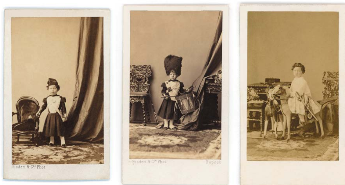
Figs. 10a, 10b and 10c André Eugène Adolphe Disdéri. Carte-de-visite portraits of the Prince imperial. May 1859.

of her friend and ally Napoleon III, gave cartes-de-visite an unexpected boost when she authorised in Spring 1860 the publication of the portraits John Jabez Edwin Mayall (born Jabez Meal) had made of her, Prince Albert and all their children. The Royal Album , as it was called, launched the fashion for carte-de-visite likenesses in the same big way Napoleon III's visit to Disdéri's studio in 1859 had. It would soon spread like wild fire.