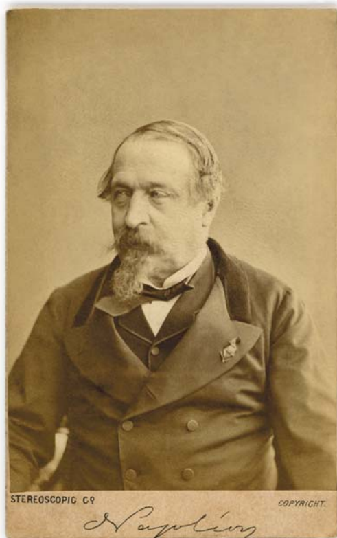
Figs. 18a and 18b The two cartes-de-visite published nearly at the same time by the London Stereoscopic Company. The caricature of the "Montmartre Red" was copyrighted on 10 April 1871.